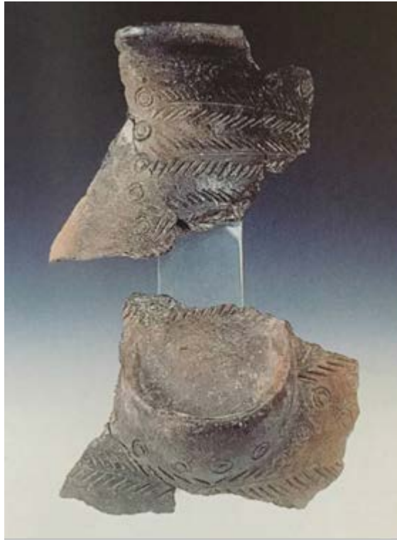
Fig. 5 - Su Nuraxi, fragments of the pyriform vase found in hut 135 (from Santoni 2001, fig. 75, p. 77).