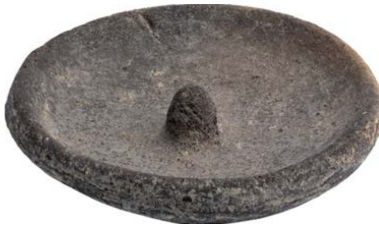
Fig. 1 - Village of Su Nuraxi, hut 186, miniature bowl (photo by Pinna P.P., RAS Photographic Archive).

Of all the artefacts a miniature pottery bowl found inside hut 186 in the village of Su Nuraxi emerges. It has smooth surfaces, with a low spheric cap, a rim that slightly faces in, with a rounded lip, and a small central circular boss (fig. 1). It dates back to the 9th-6th centuries B.C.