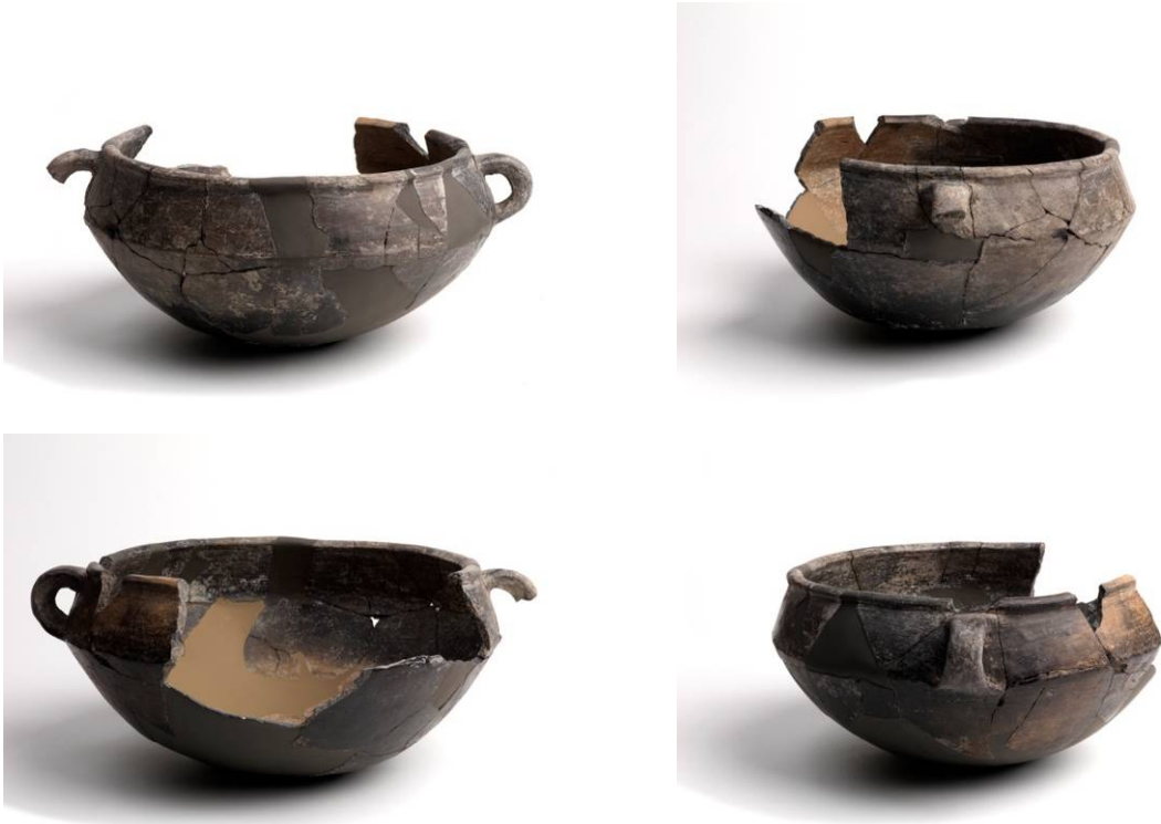
Figs. 2, 3, 4, 5 - Archaeological area of Su Nuraxi, bowl found in room 135 (RAS Photographic Archive).

One lens-shaped bowl made from pottery (12th-9th century B.C.) is well finished and waterproofed, therefore suitable for holding liquids, thanks to the polish, that reduced porosity of the clay to a minimum prior to firing. The item is wide, with inward facing walls, a quite deep tub, a wide rim, rounded hull, convex bottom and two vertical handles from the rim to the widest part of the bowl (fig. 6). This specific category of pottery, usually found in dwelling places, and linked to cooking food, dates to a period from the Final Bronze Age to the first Iron Age (12th-8th century B.C.).