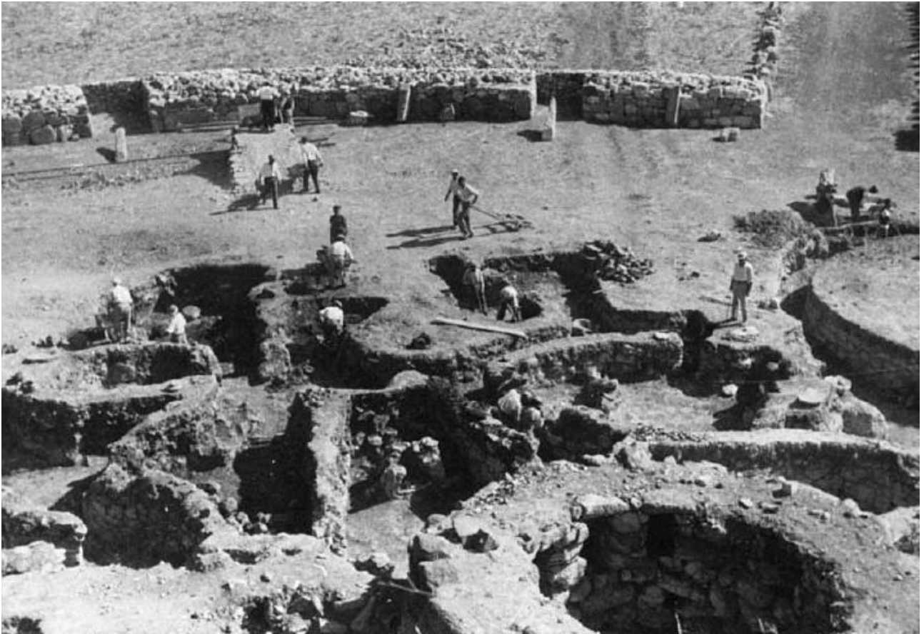
Fig. 6 - 1954, Su Nuraxi, the dig of the village near the bulwark (from Lilliu, Zucca 1988, fig. 14, page 35).

The results of the archaeological investigation were published in the scientific publication Il nuraghe di Barumini e la stratigrafia nuragica . Lilliu wrote: Large amounts of funding and men rich with enthusiasm and generosity, workers from the dig, borrowed from working in the fields, worked on the "stone giant", to bring to light the relative secrets of the architectural and building structures and, therefore, of the respective material contents.