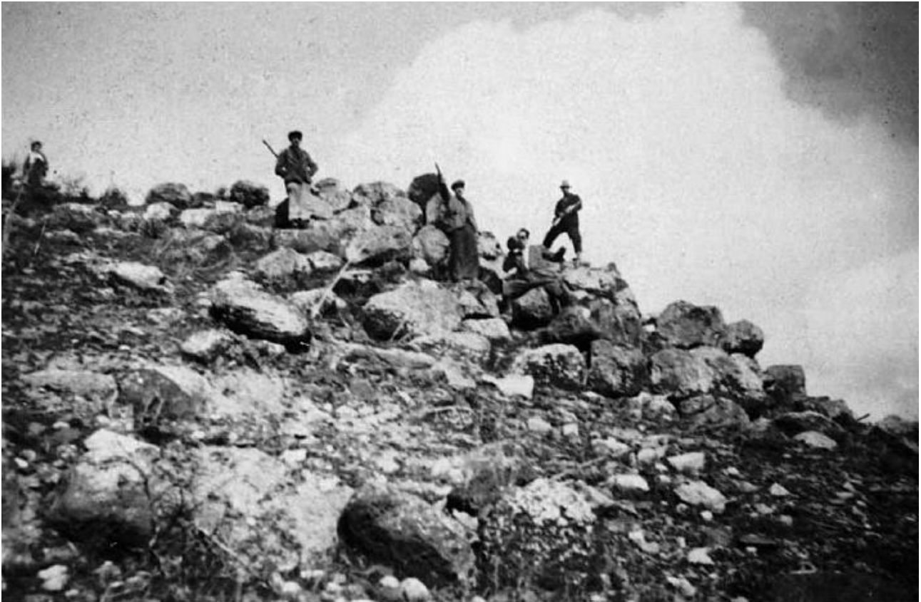
Fig. 2 - 1937, Su Nuraxi before the dig. Right, tower C of the bastion, left the courtyard (from Lilliu 1988, fig. 8, p. 28).

Exploration of the Nuragic site of Su Nuraxi in Barumini began in the summer of 1940, with a test carried out at the base of the artificial hill, limited to the opening up of a trench near the Southern tower of the bastion. The chamber in the latter, with six rows in view, was known as "Sa Funtana" (the well) and had already been partly freed in the past during a collapse during illegal digs, allegedly aimed at searching for treasure. In 1949 some preliminary tests were carried out paid for by the land owner. The dig, taken to ground level, on the South-East and North-East sides of the bastion, stopped at the height of the raised door-window of the Nuraghe. A stretch of the bulwark was found to the South-East. The courtyard was emptied by the collapse up to the level reached outside and showed up the foyer between the courtyard and the door-window, which was found full of human skeletons from the Historical Age. The Eastern tower C of the quatrefoil body was also brought to light, the top of which was filled with limestone marl ashlar, for renovation purposes, which created a chromatic contrast with the basalt façade.