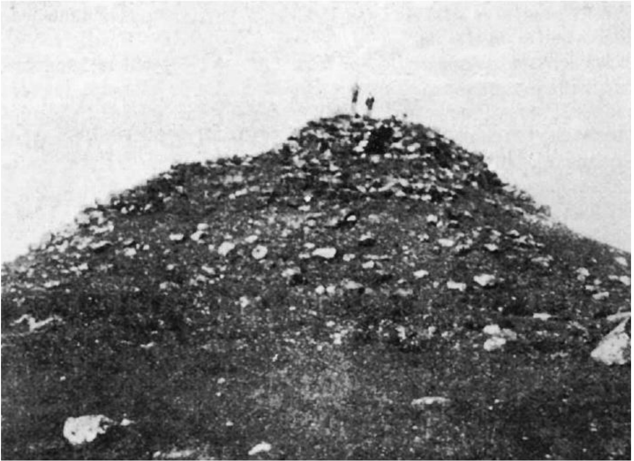
Fig. 1 - 1937, archaeological area of Su Nuraxi, before the digs (from Lilliu, Zucca 1988, fig. 6, page 24).

The young archaeologist Giovanni Lilliu understood there to be a buried Nuraghe on the high plain. The land above was ploughed and barley and runner beans were planted. Not wheat, however, as the land was shallow, not suitable for wheat. In 1938 Lilliu wrote the first description of the large ruins of the monument, for which he recognised the layout, given by four perimeter towers that surround the central tower (fig. 2).