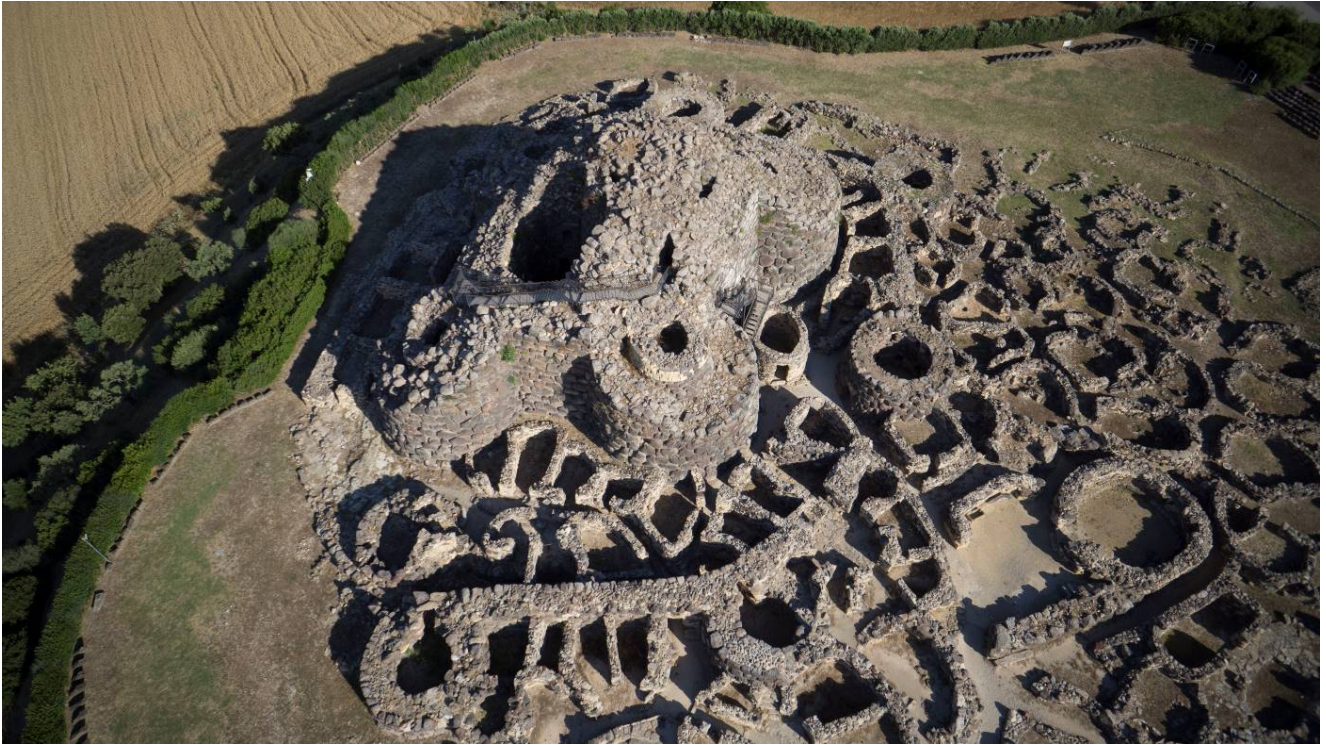
Fig. 9 - Aerial view of archaeological area.

Su Nuraxi is now the best-known Nuragic monument in the world, also thanks to its inclusion in the list of World Heritage Sites in 1997 (fig. 9).