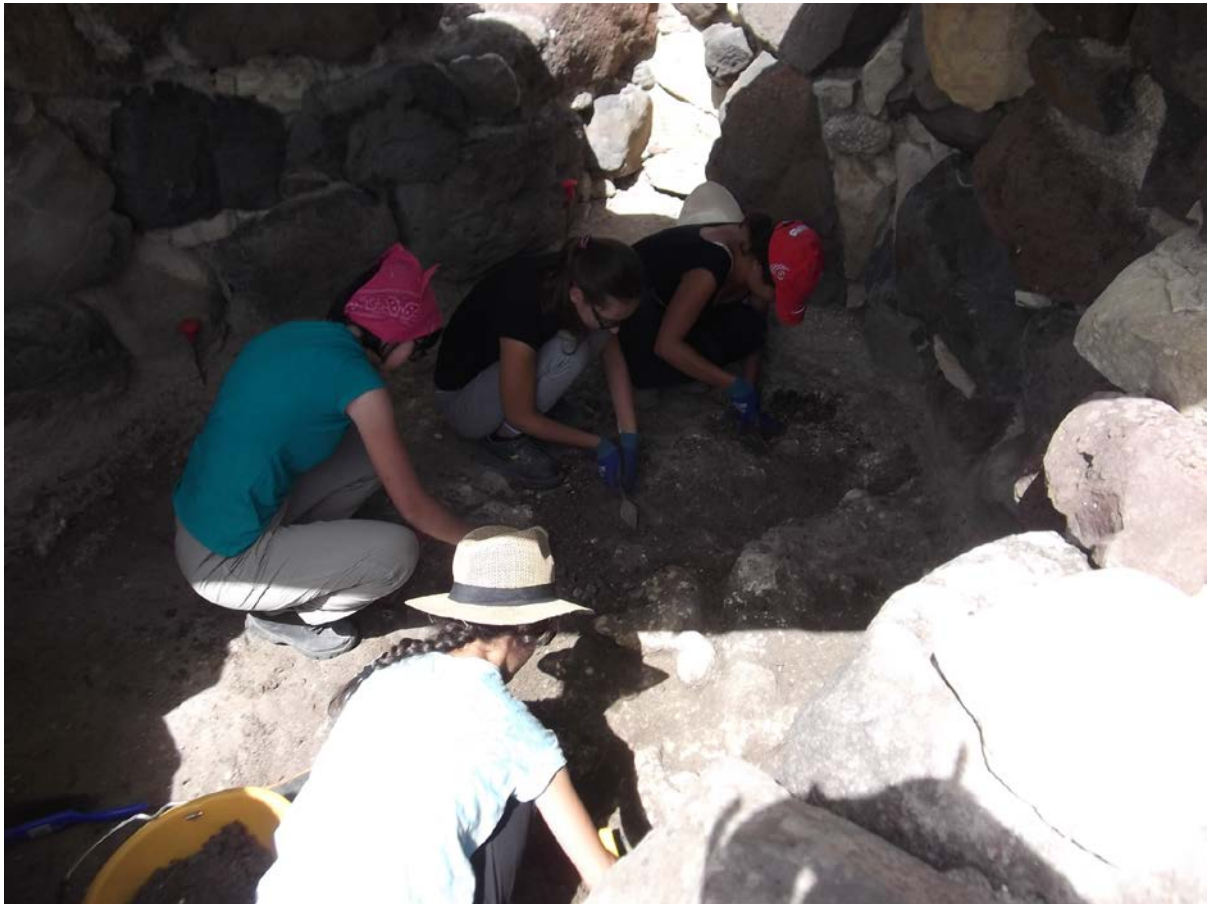
Fig. 8 - A film of the site digs by the University of Cagliari (from http://www.sardiniapost.it/wp-content/uploads/2015/09/DSCF2763.jpg ).

After the stratigraphic surveys carried out by Giovanni Ugas in the 1980s and in 2003-2004 and 2007-2008 by Vincenzo Santoni, a new campaign of digs is currently ongoing in the village of Barumini, lead by the University of Cagliari, in close collaboration with the Archaeological Superintendency of Sardinia, funded by the Municipality of Barumini and the Fondazione Barumini Sistema Cultura, that involves the area North-East of the Nuragic village, the so-called "tower-hut" and hut 197 (fig. 8).