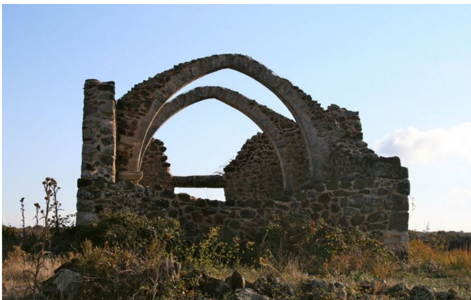
Fig. 4 - The ruins of the church of San Simeone, Bonorva.

The remains of the medieval village of Sanctus Simeon and the church of the same name located on private property on the plain that lead to “Su Monte” and the Campeda plain are also close to the muras . Today, the single-apse building is now rather deteriorated (fig. 4).