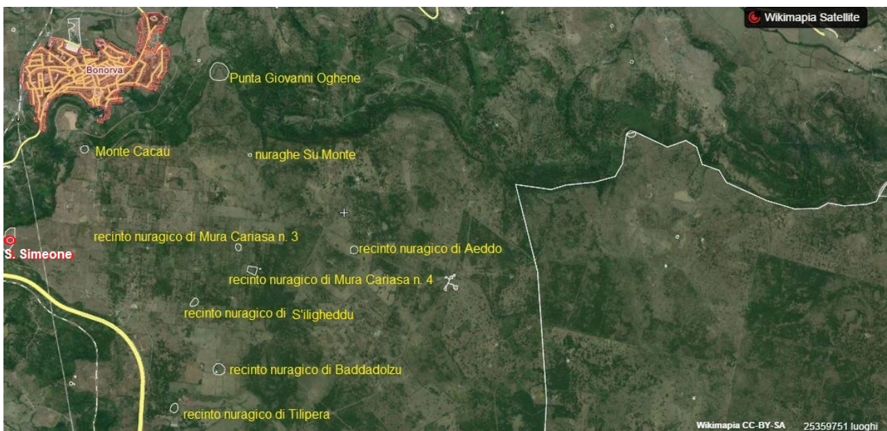
Fig. 1 - The nuragic boundary area (from Wikimapia (reprocessing by M.G. Arru).

The San Simeone archaeological complex is one of several archaeological, architectural, historical and monumental heritage in the municipal area. The area on which the historical complex stands is 625 metres above sea level, on the Su Monte plain, where the long anthropic continuity is proven by the presence of monuments that can be dated to a period running from the Nuragic Age to the Middle Ages. From this high plain, which was of great strategic importance, it was possible to control the route between the high plain of Campeda and Meilogu and the connections between the north and the western-central area of Sardinia (fig. 1).