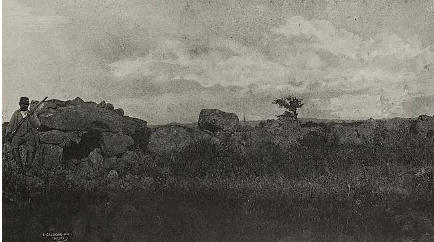
Fig. 2 - Old photo of the Mura de Sos Alvanzales wall (by Taramelli 1919, fig. 15, pages 37 - 38).

There is a fortified complex on the Su Monte plain, that comprises eight megalithic boundaries (muras). The boundaries are close to each other and are formed by big walls, 2 metres high and 2.5 metres thick, rounded and trapezoidal in shape, and accessible from a rectangular entrance (fig. 2).