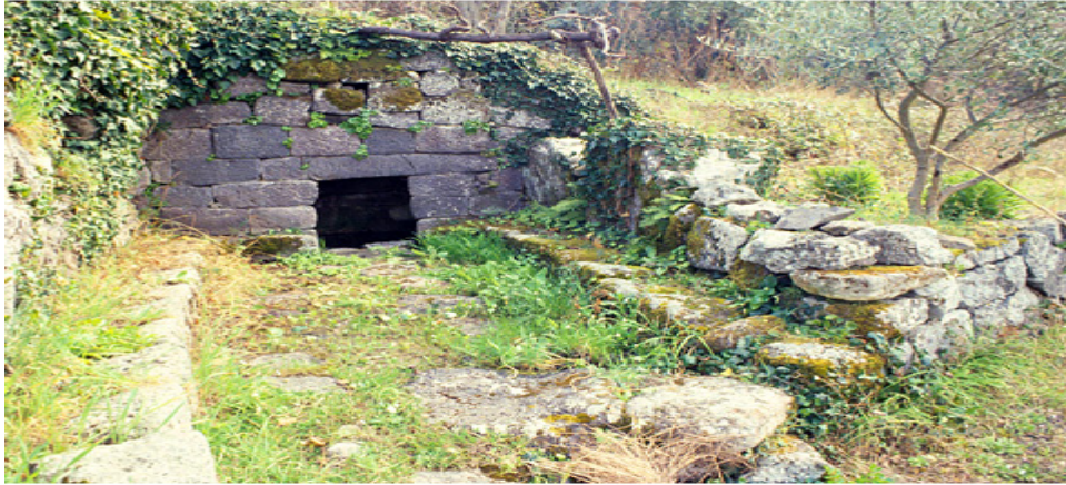
Fig. 4 - Su Lumarzu nuragic font.