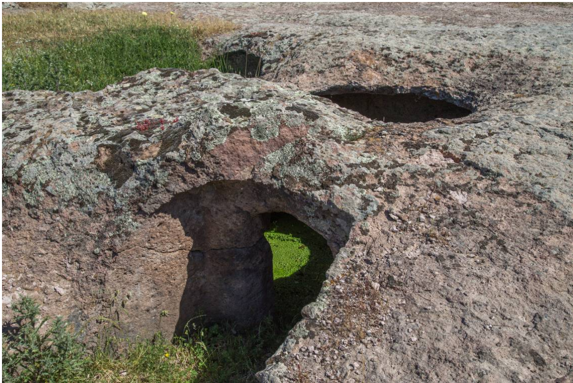
Fig. 3 - Hypogeum XII