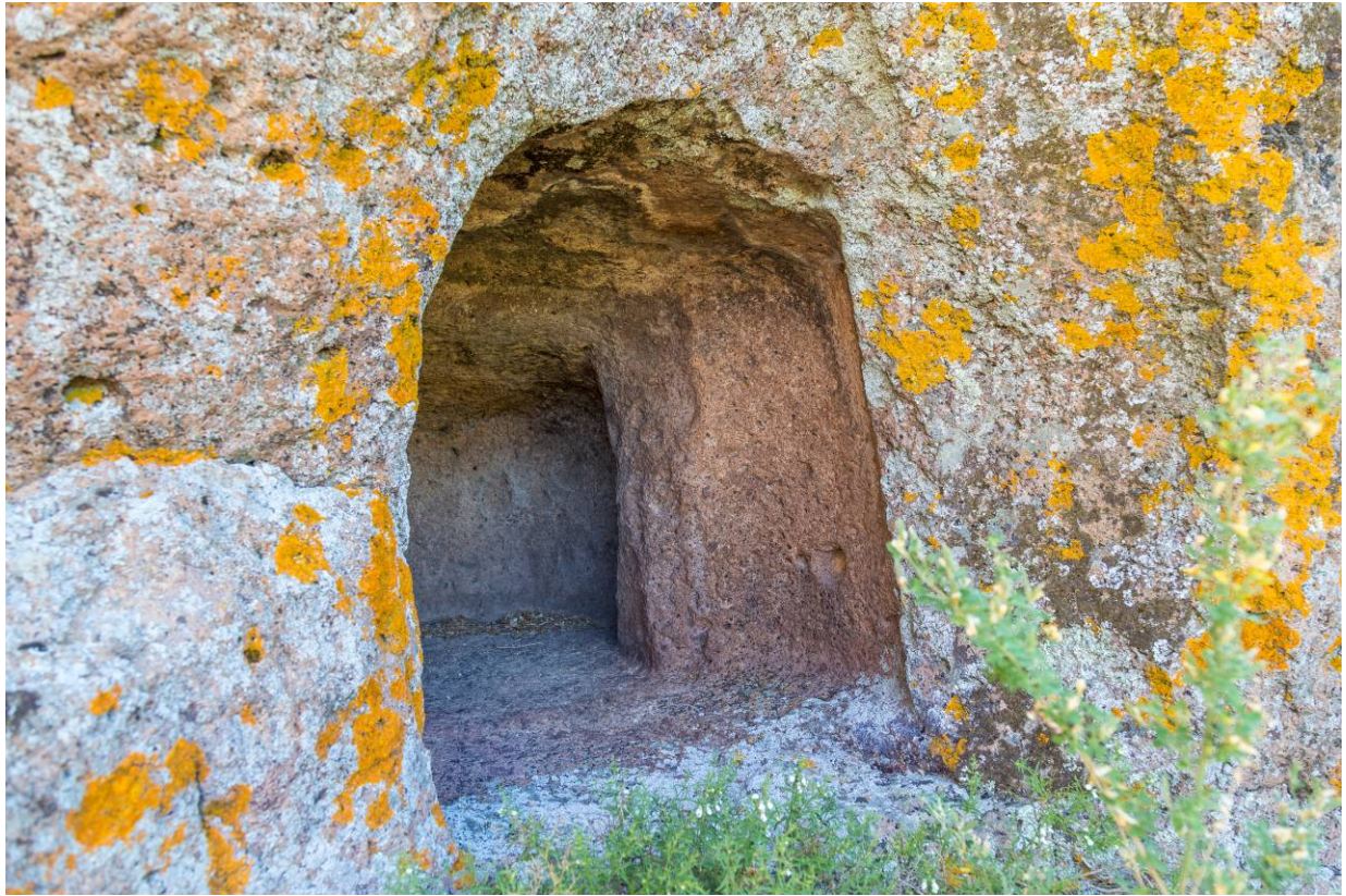
Fig. 5 - Hypogeum XV.