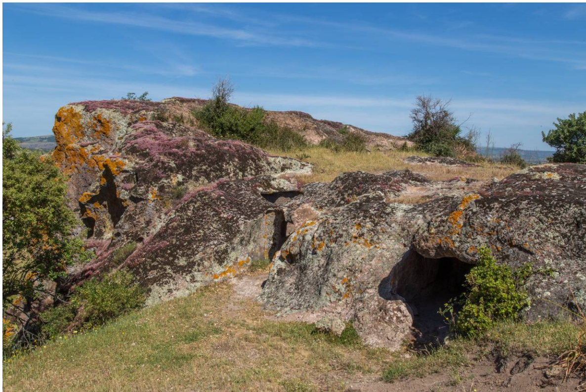
Fig. 4 - The hypogeums XIII, XIV located on top of the plain.

The domus de janas XIV (fig. 4) is a simple single-cell structure. It has a small open-air corridor (dromos), the final stretch of which, roofed, was the ante-cell. The cell is entered from a hatch with a raise step, where the flat ceiling has now partly collapsed. It communicates with the nearby hypogeum XIII via an open door in the South-east wall. The cell has a niche in the Northwest wall.