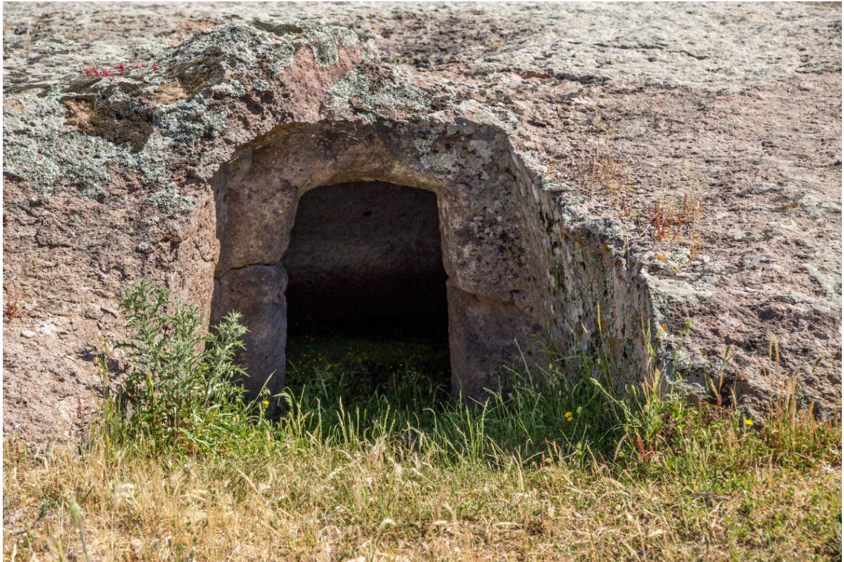
Fig. 2 - Entrance to hypogeum XII (photo by Unicity S.p.A.).