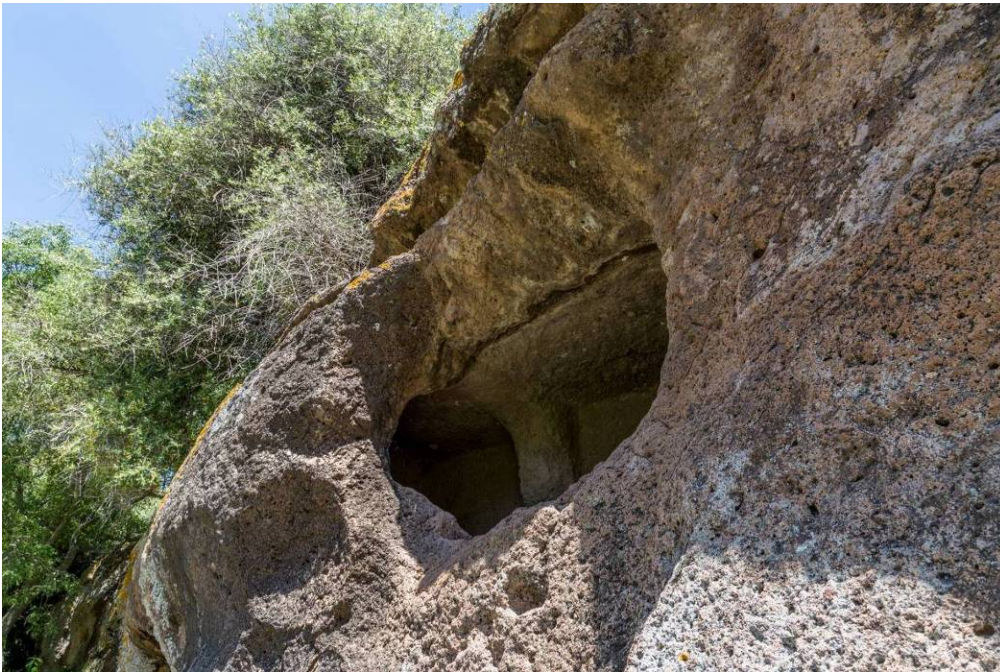
Fig. 1 - Detail of the entrance to the domus de janas V by S. Andrea Priu, otherwise known as “Tomba a capanna circolare” or “Tomba a domus ”.

Currently, access to the “ domus de janas a capanna circolare ” stands at about 9 metres, as the front part of the rock has collapsed and destroyed the original entrance (fig. 1).