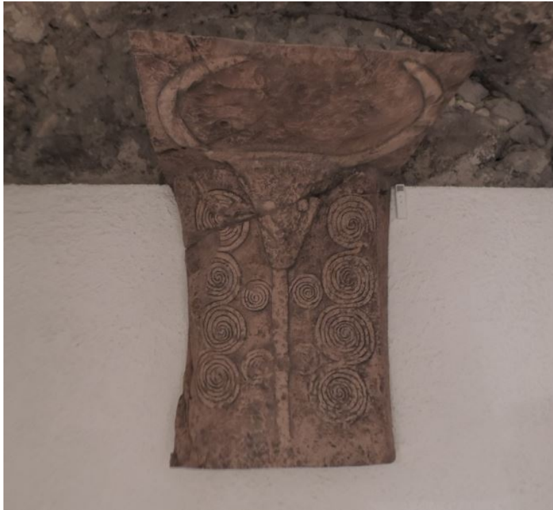
Fig. 7 - Copy of bull protome from the "Tomba delle spirali", "Tenuta Mariani" necropolis.