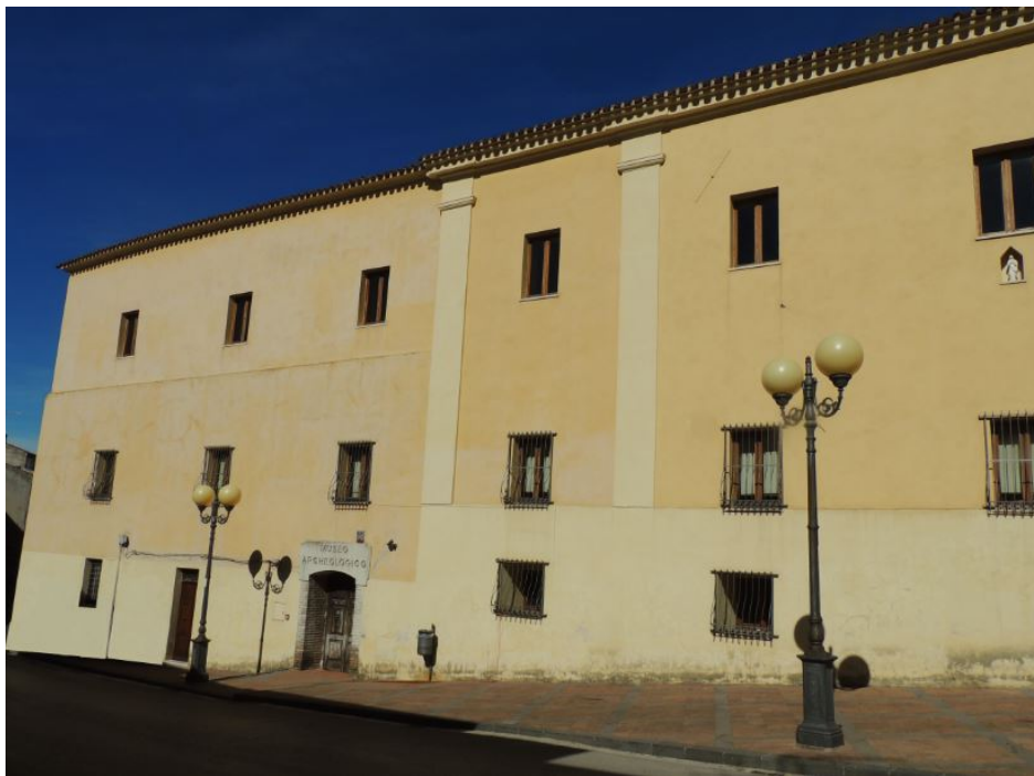
Fig. 1 - The former convent building that houses the Museum.

The Civic Archaeological Museum of Bonorva is housed in part of the former Franciscan convent annexed to the church of Sant'Antonio, in the centre of the old town (fig. 1).