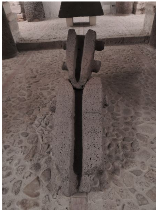
Fig. 4 - The canals from Funtana Oghene.

There are numerous items from the Roman era, such as funeral stones (fig. 5), graves, mills and inscriptions (fig. 6) that lead to a number of settlements spread over the hills, plains and along rivers.