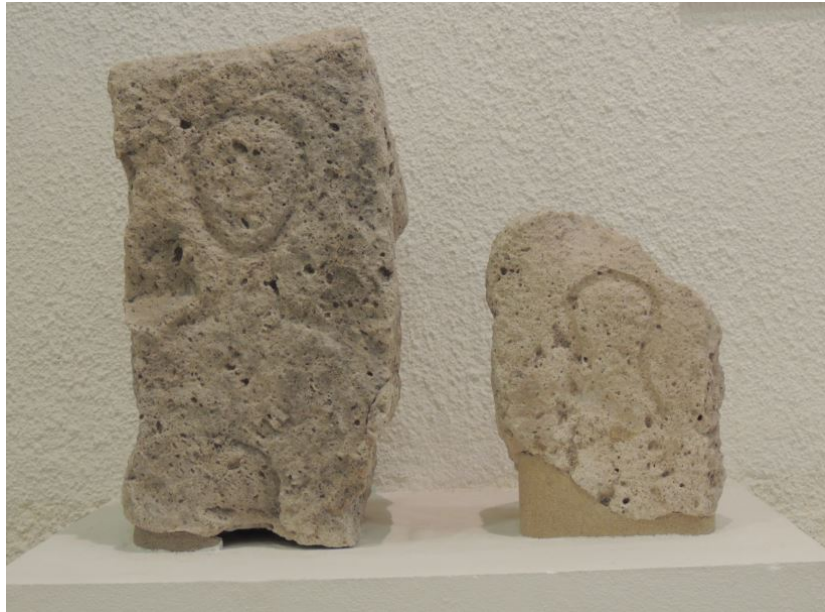
Fig. 5 - Decorated stelae coming from the tombs in Su Terranzu.