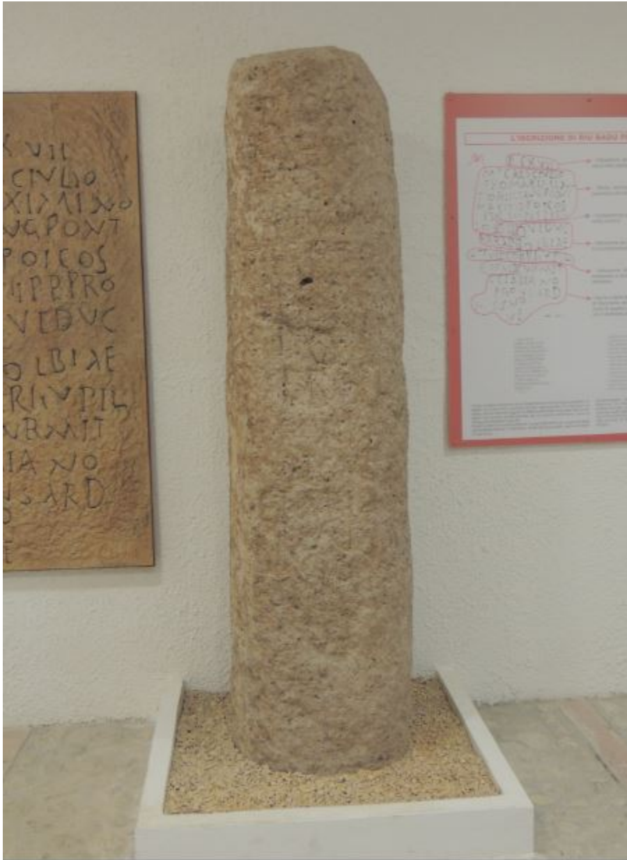
Fig. 2 - Milestone from the area of Rio Badu Pedrosu, Bonorva Archaeological Museum.

In spite of the difficulties due to the loss of most of the milestones and the disappearance of the roads, it is still possible to identify the itinerary, that wound for 65 miles, i.e. 96 km according to calculations (fig. 3).