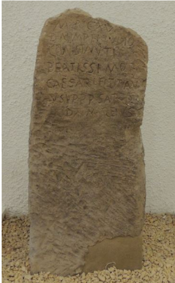
Fig. 1 - Milestone from Mura Menteda, Bornova Archaeological Museum.