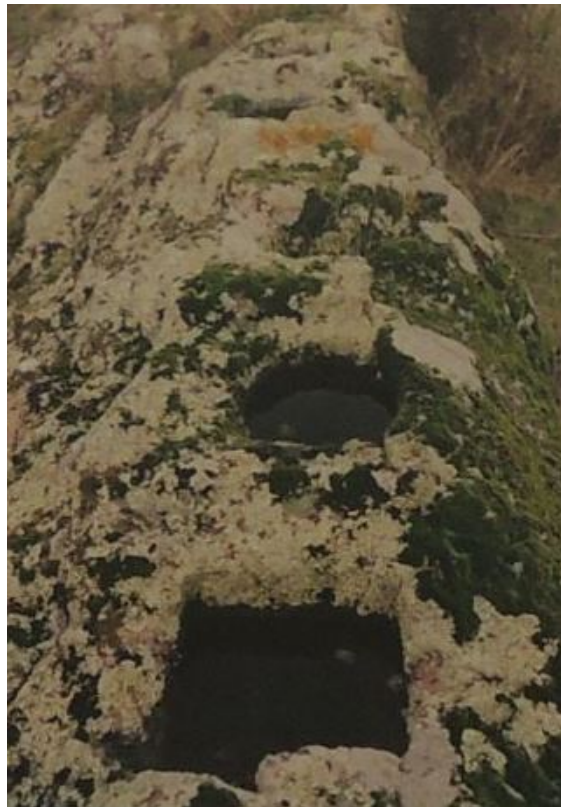
Fig. 3 - Su Terranzu necropolis (photo by Bonorva Archaeological Museum).