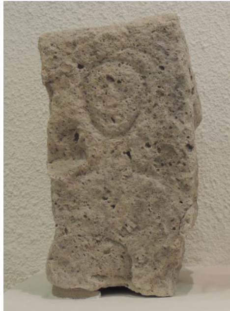
Fig. 4 - Stelae from the Su Terranzu necropolis. Bonorva Archaeological Museum.

It was common to mark the tombs with stelae with engraved funeral symbols, placed vertically over the burial site. At Su Terranzu two from the Punic-Roman Age were recovered. The first carries the picture of a human heavily influenced by Punic iconographic tradition that re-emerged in rural areas (fig. 4); the second is partly preserved and is of a similar image (fig. 5).