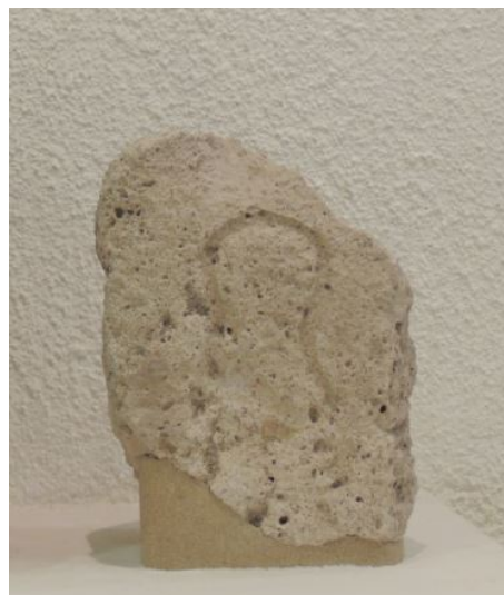
Fig. 5 - Stelae from the Su Terranzu necropolis. Bonorva Archaeological Museum.