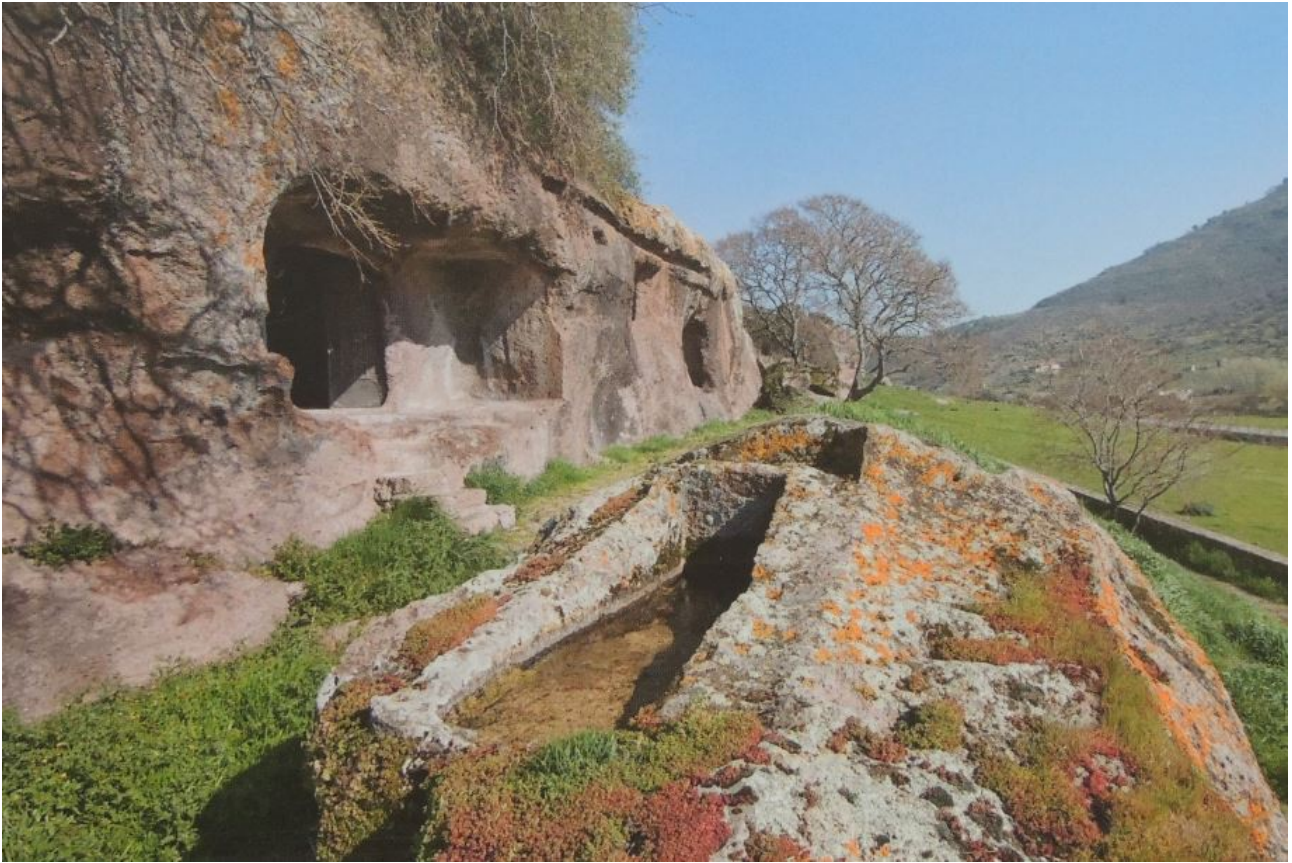
Fig. 3 - S. Andrea Priu, the tomb outside the rock church (by Area di Bonorva).