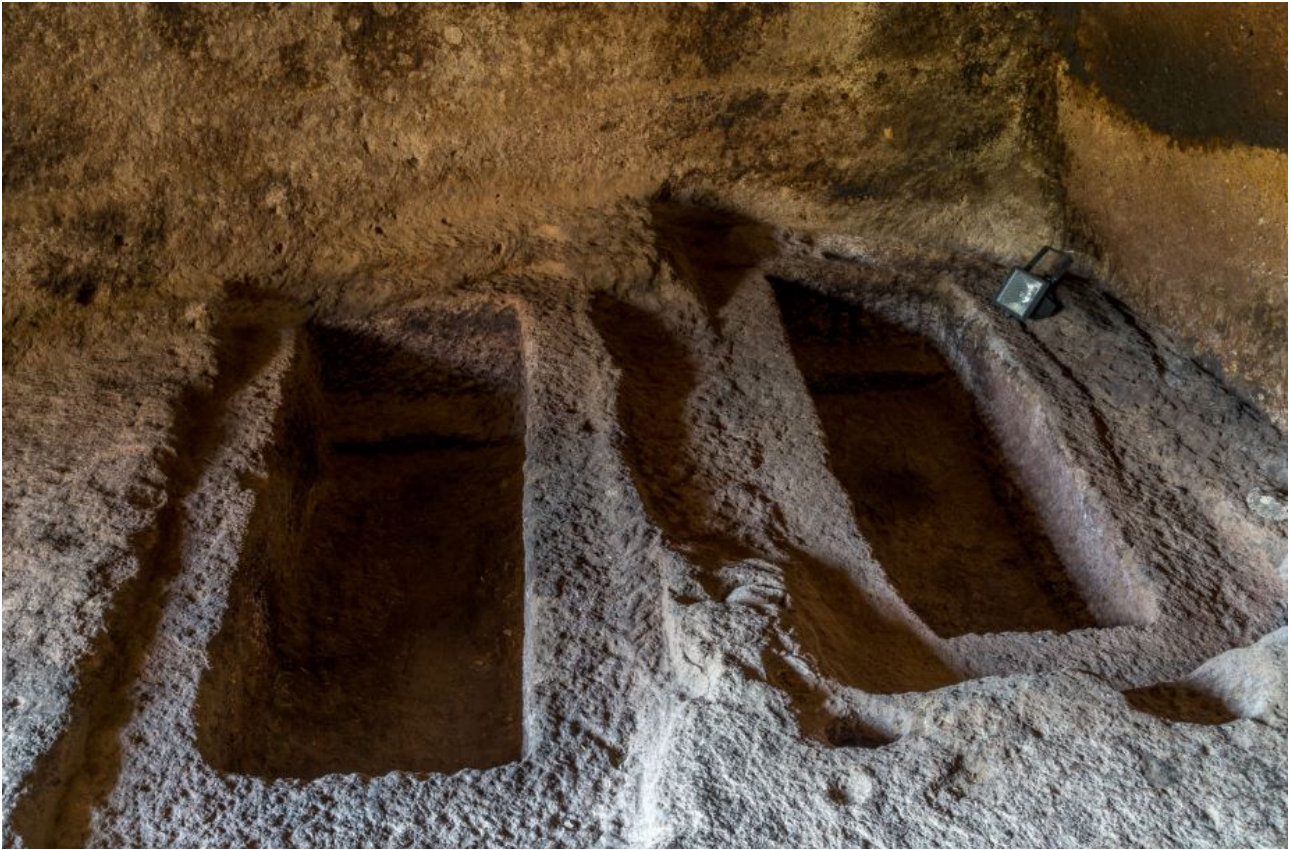
Fig. 2 - Byzantine tombs dug into the inner narthex floor of the rock church.

Opposite the entrance to the rock church, there is a large block of trachyte, about 8 metres long and 3 metres wide, on the top of which a tomb has been dug out, while in the south-east part stairs are cut out of the rock (figs. 3-4). This tomb, with pulvinus, is on a northwest-southeast axis, is 188 cm long (6 Byzantine feet), about 55 cm wide and 35 cm deep at the pulvinus and 70 cm on the opposite side. There is a recess about 10 cm wide around the tomb that was used to rest the cover stone on. It is dated to the High Middle Ages, as are the two tombs dug out of the floor in the endo-narthex, that it is similar to in type and make.