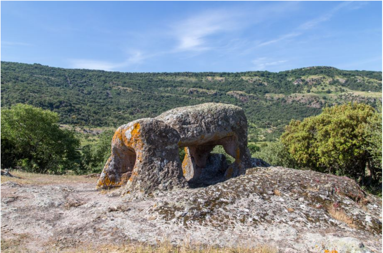
Fig. 1 - The so-called “Campanile” or “Toro”

On top of the hill where the hypogeum Sant’Andrea Priu necropolis has been dug, in addition to some domus de janas , there is a characteristic rock, known as the “Campanile” or the “Toro”, that is a large trachyte mass of rock like a table, supported by pillars (fig. 1).