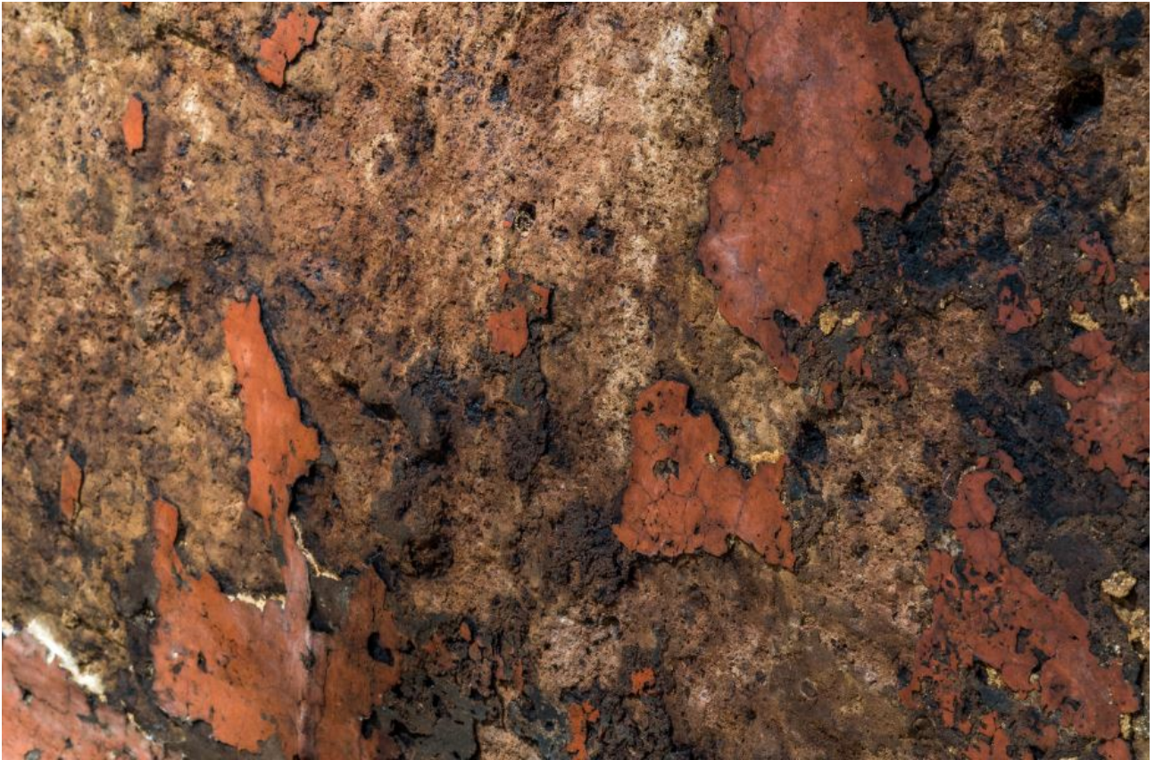
Fig. 6 - Traces of red ochre found on the ceiling of the endo-narthex.