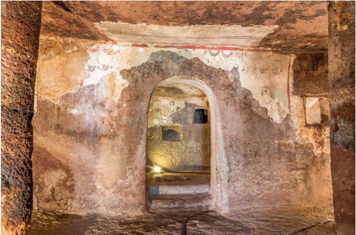
Fig. 3 - The door that leads from the room to the bimah.