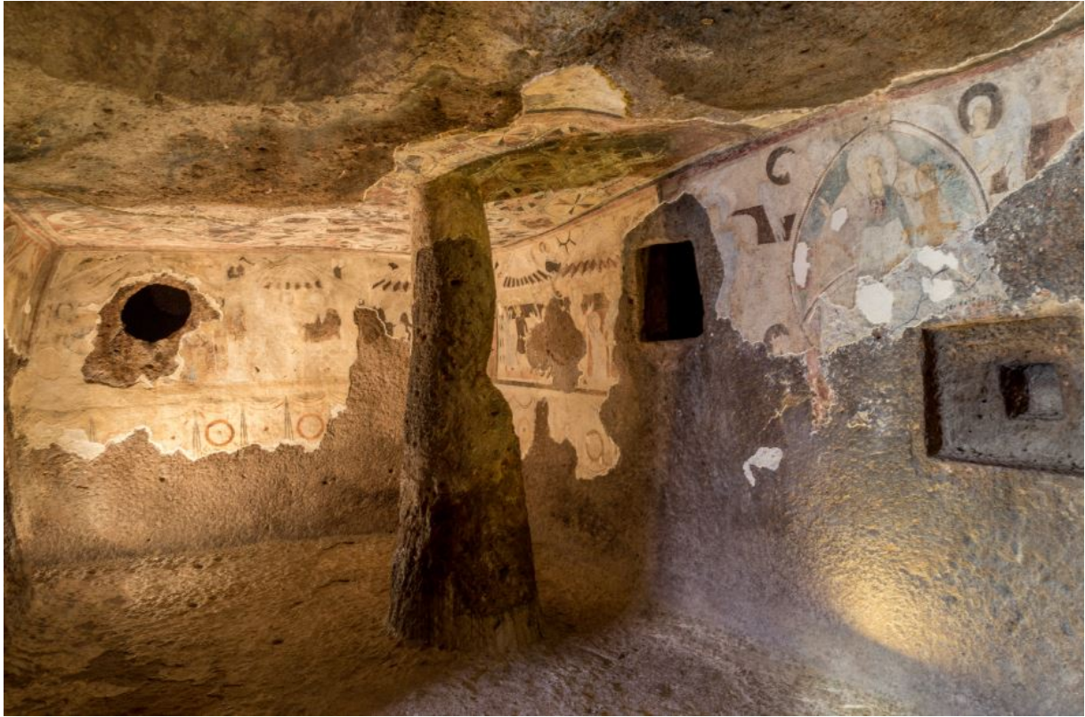
Fig. 4 - Frescoes with scenes from Jesus' life.