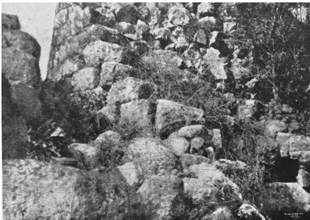
Fig. 1 - Puttu de Inza nuraghe (by Taramelli 1919, fig. 31, pages 77 - 78).

There is a bronze brooch 15.5 cm long (fig. 2) found in the material from the collapse of the nuraghe at Puttu de Inza (fig. 1), on the Santa Lucia plain.