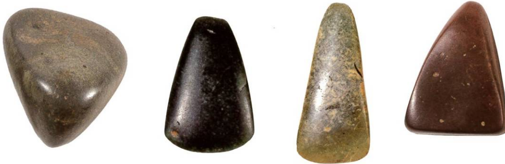
Figs. 3, 4, 5, 6 - Arzachena, Necropoli di Li Muri, lithic hatchets (by Antona 2013 page 83).

This is a rather common tool, belonging to the stone industry category in polished stone, found in prehistoric settlements (figs. 3, 4, 5, 6).