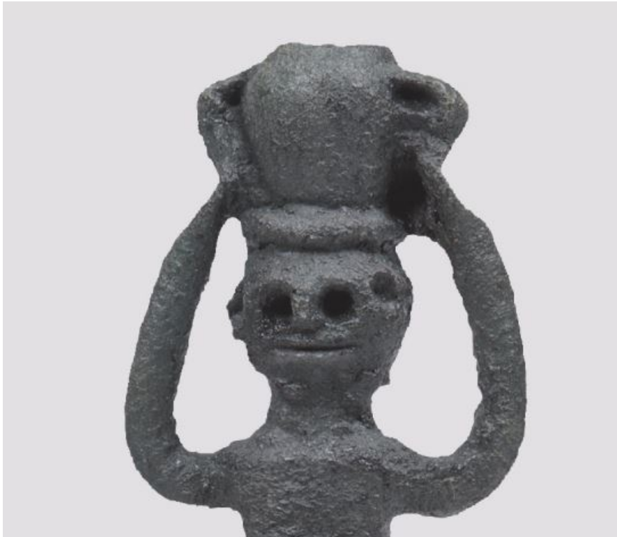
Fig. 4 - Bronze statue of water carrier; Cabu Abbas nuraghe -Olbia (from Lo Schiavo 2014, page. 115).