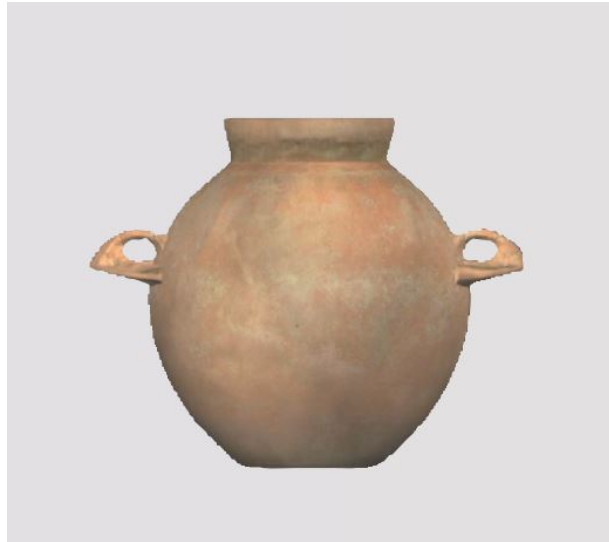
Fig. 2 - Rounded pottery vase with round handles found on the Pyla-Kokkinokremos site (from Lo Schiavo 2014, page. 115).