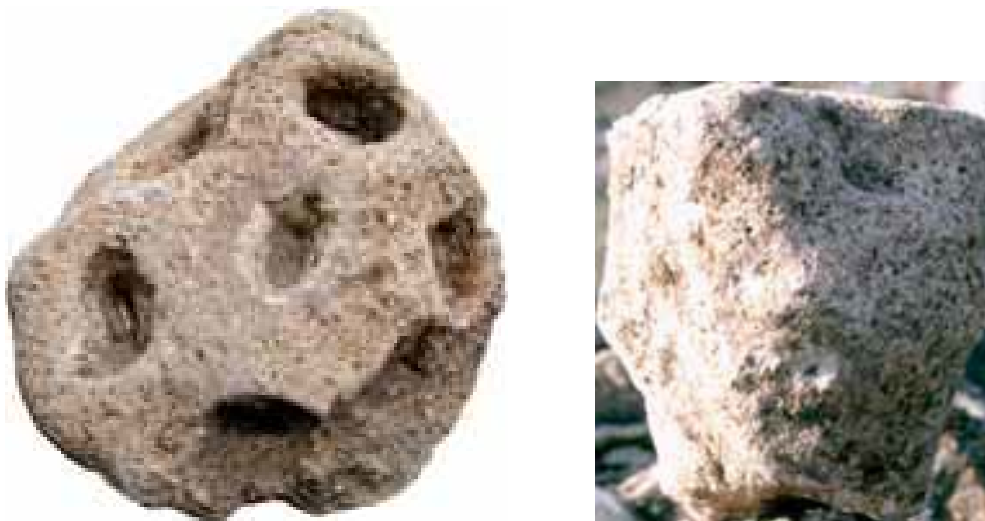
Figs. 1, 2 - The nuraghe model found at the megaron A temple (From Fadda 2012, figs. 15-16, pages 13-15).

The remaining fragment of the sculpture (size: height 18 cm; diameter 15 cm) has been obtained by chiselling and smoothing the limestone rock. It reproduces a miniature Nuragic tower, with the cylindrical centre marked by an inner line that divides it from the part that is the top terrace. There are seven oval holes in the upper part, arranged in a circular pattern, one of which is central, needed to insert bronze votives for religious rituals that were carried out in the temple area (figs. 1, 2, 3).