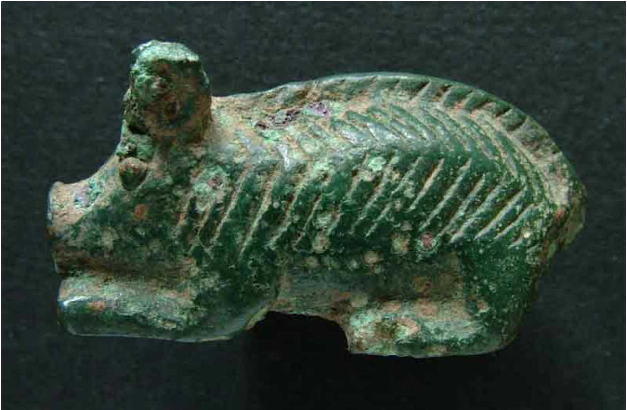
Fig. 3 - Statuina zoomorfa a forma di cinghiale proveniente dal deposito votivo di Sa Carcaredda.

offerers and animals), daggers, lance tips, axes, bangles and parts of necklaces in amber and rock crystal, datable between the 12th and 7th century B.C. (fig. 3).