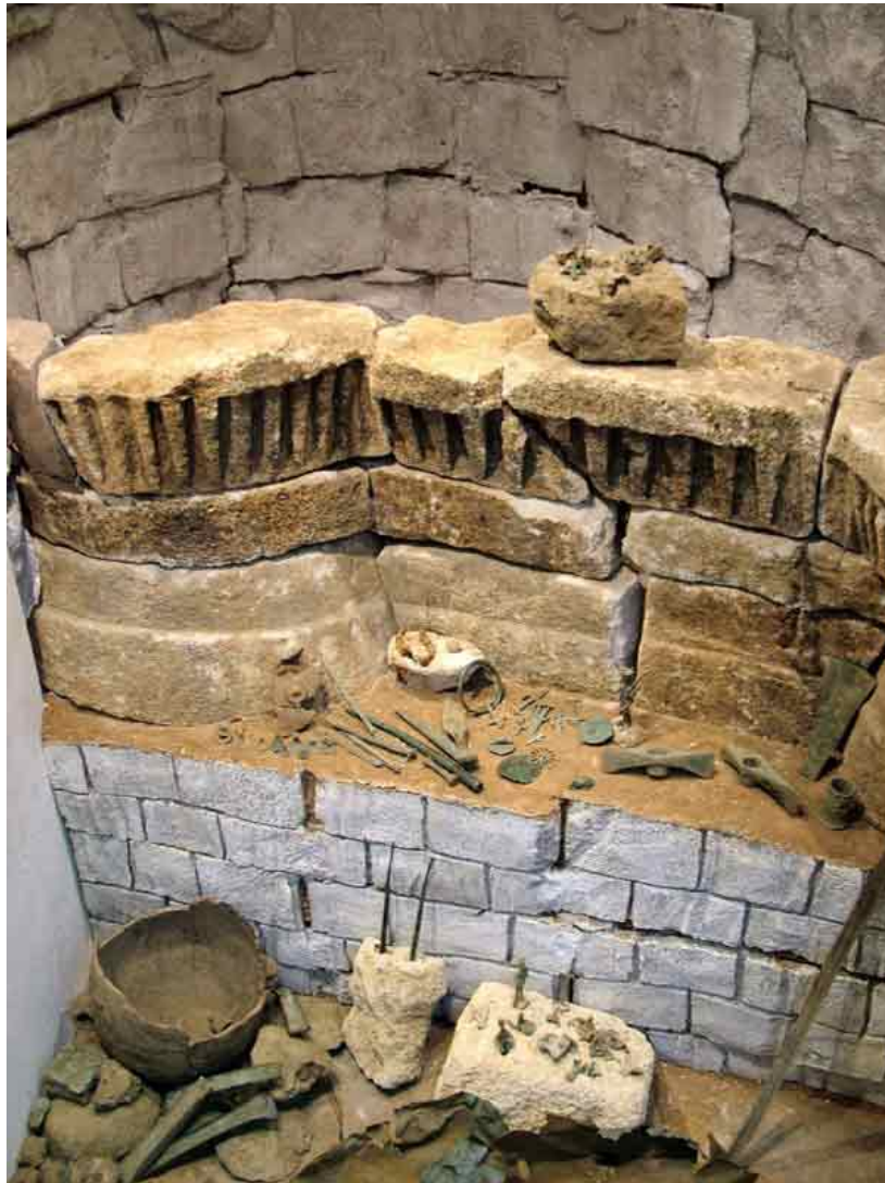
Fig. 2 - Reconstruction of votive store at the temple of Sa Carcaredda.

In a specific side pseudo-rectangular storeroom, votive offers were hoarded; ox-hide ingot and lumps were found together with some pottery (e.g. urns) and bronze items. Inside the circular cell, the ritual fireplace, bordered by a wall made from small blocks of limestone covered in a layer of clay, and a votive altar for offers in the shape of a Nuragic tower, on the base, also made with limestone blocks joined with molten lead in the T-shaped incisions on the inside, show the sacred character of the temple (fig. 2).