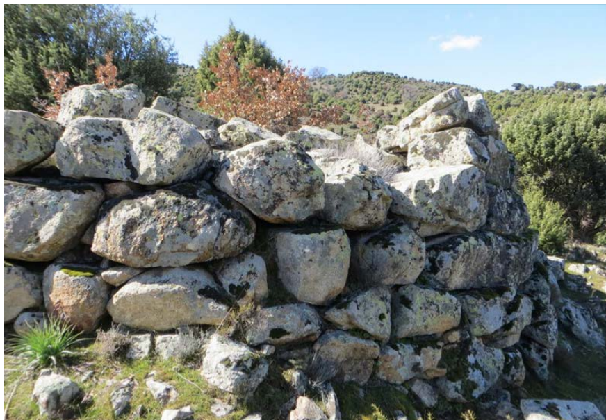
Fig. 2 - Nuraghe Lalzoracesus or Lotzoracesa

With reference to archaeological data, the documentary picture is selective and only fragmented. The Nuraghi remains (fig. 2) and the giants' tomb (fig. 3), precious archaeological clues, allows us to see a possible site of stable visiting for people who travelled along the transhumance paths.