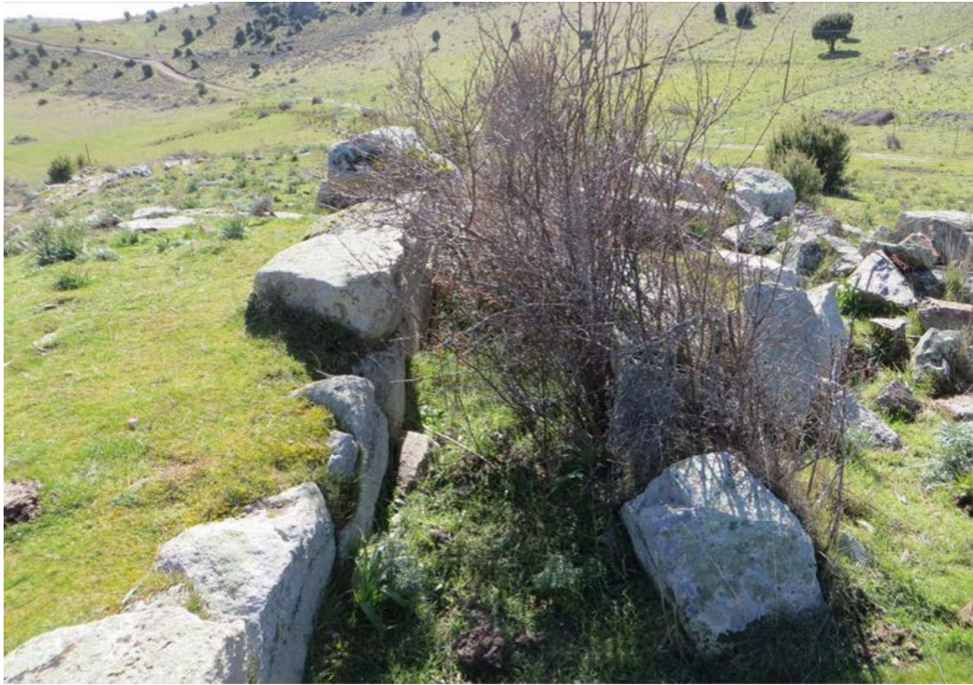
Fig. 3 - Giants' tomb at the Lalzoracesus or Lotzoracesa Nuraghi.