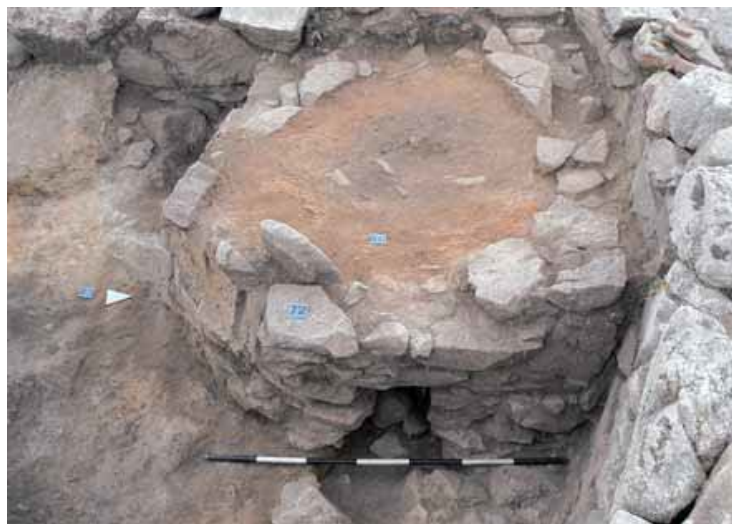
Fig. 4 - Fireplace-oven (from FADDA 2012, fig. 51, p. 36).

Metal was worked on the bottom of the ancient oven, still preserved, each time renewing the baked-clay bottom; on the Northwest side, in an open space, slightly concave, there were the bellow nozzles that fed the fire (fig. 4).