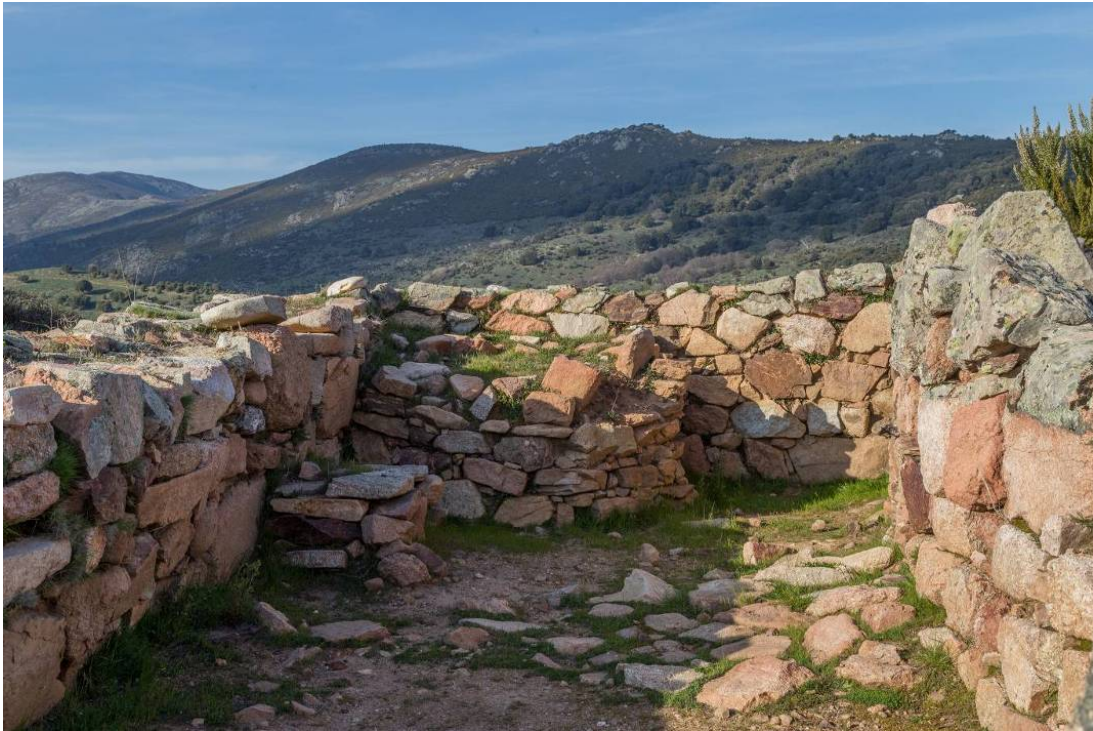
Fig. 3 - Megaron 3.

Metal was worked on the bottom of the ancient oven, still preserved, each time renewing the baked-clay bottom; on the Northwest side, in an open space, slightly concave, there were the bellow nozzles that fed the fire (fig. 4).