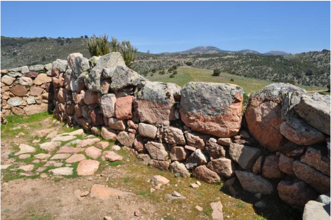
Fig. 2 - Interior of the megaron 3, flooring and walls.

levels of burned clay, due to the rebuilding of the floor and the arrangement of small low-fire ovens around the walls (fig. 2).