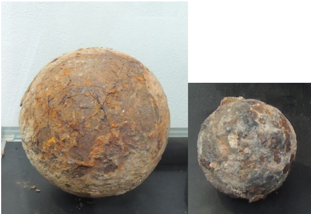
Fig. 2 - Iron canon balls in the Sassari Museum (photo M.G. Arru).

Canons equipping the towers had smaller calibres, sizes and weight. Not only was it quite difficult to raise a long, heavy canon on to the place-of-arms, but the tower's vault could not be loaded excessively; what's more, canon size had to be compatible with the small space available on terraces.