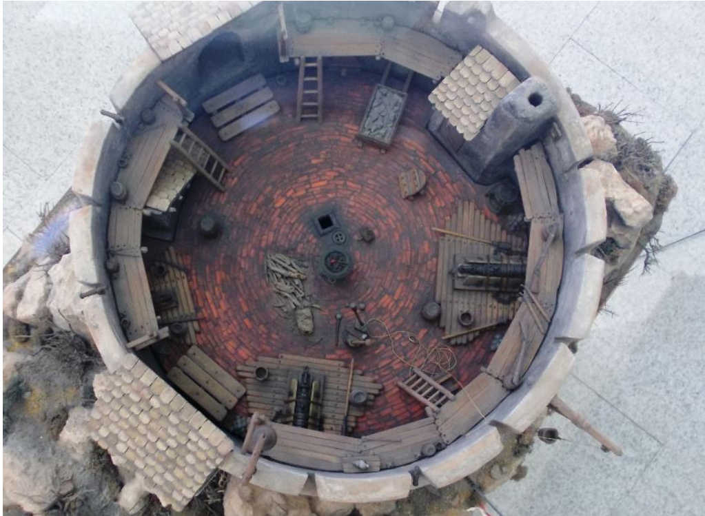
Fig. 4 - Model of a coastal tower: the place-of-arms (Museum of towers of Sardinia).

They placed strong planks ( madrieri ) under the canon's wheels, to protect the floor of the "Place-of-arms", and after the shot canons were put back in their blocks using levers (fig. 4).