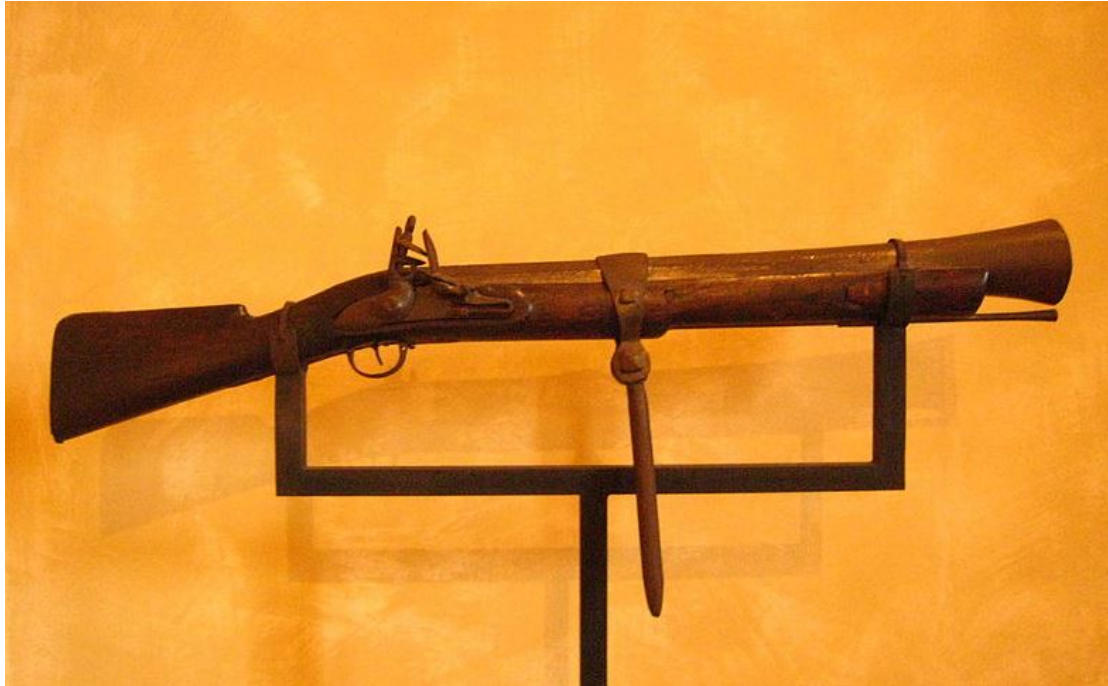
Fig. 3 - Spingarda (mortar).

rifle for each tower soldier with a few hundred bullets (fig. 3); a score of flints for the rifles. There was also everything possibly needed : axes, bill-hooks, tarred rope, water barrels, a copper boiler with tripod, a steelyard balance, earthenware jars.