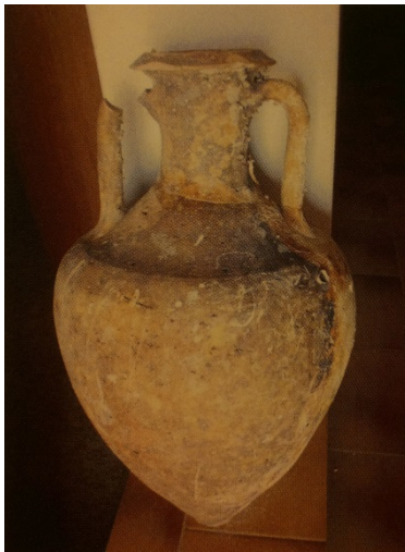
Fig. 3 - Amphora from the sea of Arbatax (from A.a.V.v. 2005, p. 73).