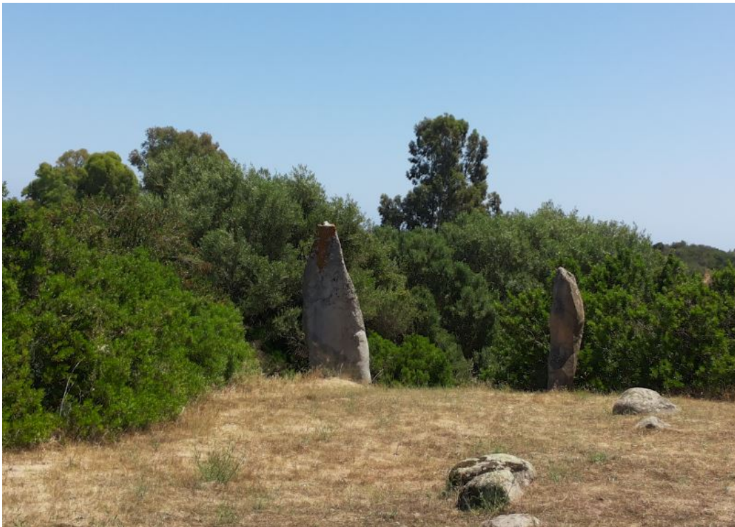
Fig. 7 – Menhirs of S'Ortali 'e su Monte (photo by Unicity S.p.A.).