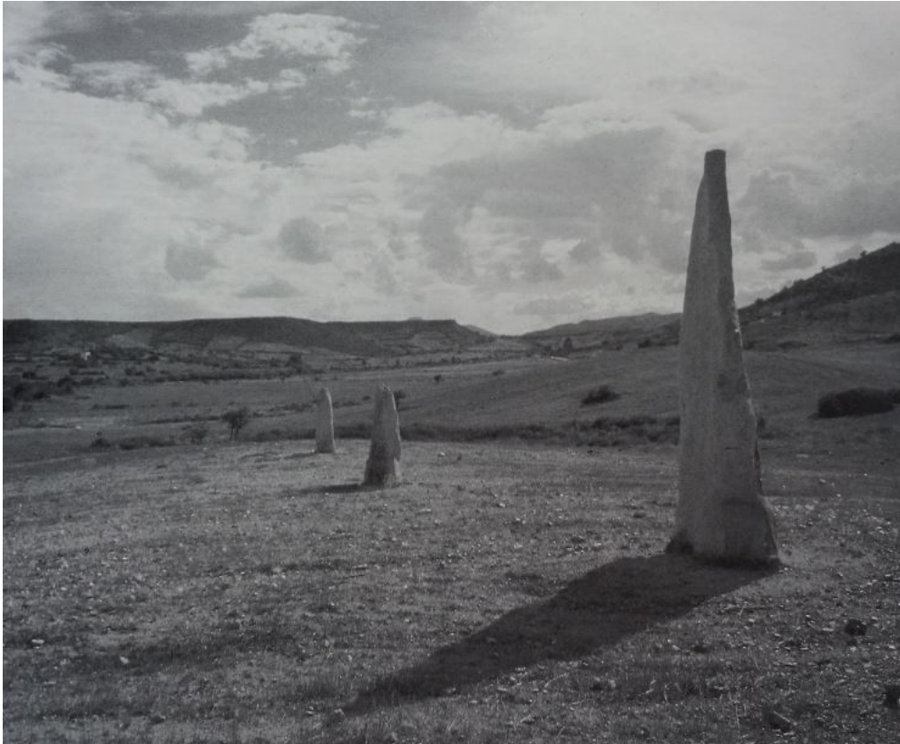
Fig. 2 - The alignment of menhirs of Perda Longa - Tortolì (from Archeo System 1990 a, p. 66).

Of these communities we still have the tombs ( domus de janas ) and elements which can be connected to the so-called megalithic religion, such as menhirs (fig. 2), cup-shaped boulders, sacrificial stones, schematic petroglyphs (fig. 3). However, there are no remains from living quarters.