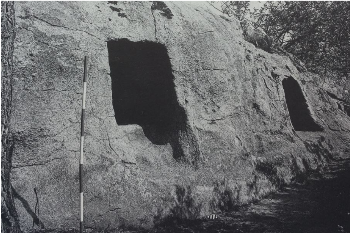
Fig. 5 - Domus de janas di Monte Terli (da ARCHEO SYSTEM 1990 b, p. 67).

At S'Ortali 'e su Monte , the archaeological area with the nuraghi and the tombs of giants also has a domus de janas (fig. 6) and some menhirs (fig. 7). The underground tomb, dug into the northern side of the hill, has a vestibule leading, through a hatch, into a pseudo-rectangular cell with a double niche.