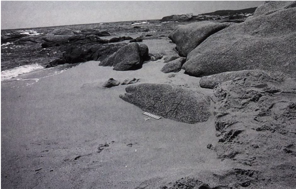
Fig. 3 - The rock on the beach of Orrì with the anthropomorphic petroglyph (from Archeo System 1990 a, p. 69).

The archaeological complex of San Salvatore is structured around the country church of the same name and includes: two domus de janas , three aniconic menhirs and a cup-shaped boulder (fig. 4). Of the two domus , dug into a rocky granite spur, the former has been badly damaged by several collapses and its plan is not easy to read; the other, a few metres away, has a trapezoidal plant vestibule which leads to two longitudinal cells.