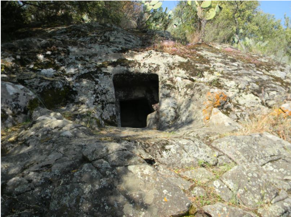
Fig. 6 - The domus de janas of S'Ortali 'e su Monte.