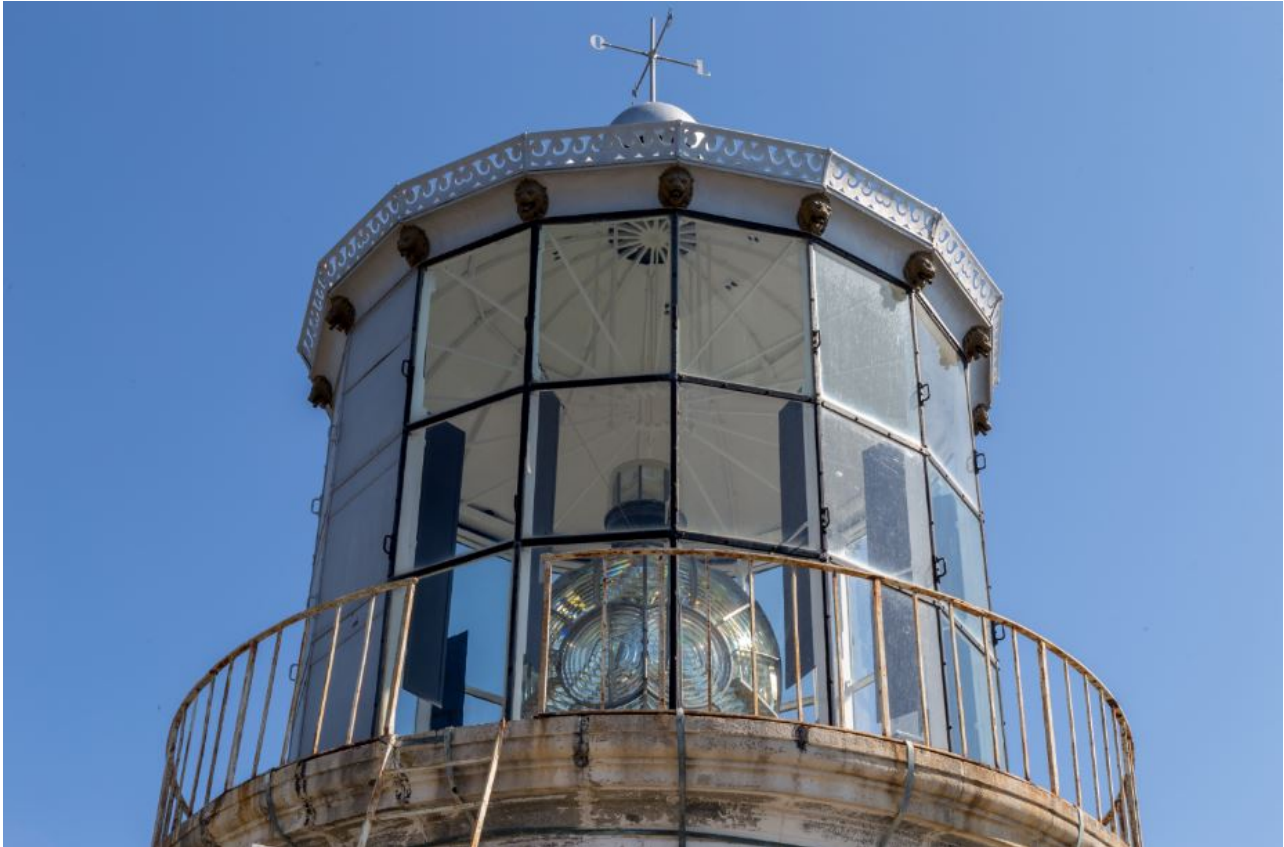
Fig. 2 - The lantern.

The lighthouse is 19 metres high and its light beam has a range of 26 miles. The large lantern is surmounted by a cast iron dome ending with a wind vane and the outer windows are embellished with small heads of lions hiding the outflow of rainwater (fig. 2).