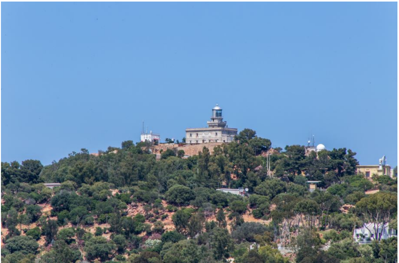
Fig. 1 - The headland of Capo Bellavista with its Lighthouse.

The headland of Capo Bellavista, three kilometres from Arbatax, houses the Faro di Capo Bellavista at 165 metres above sea level (fig. 1).