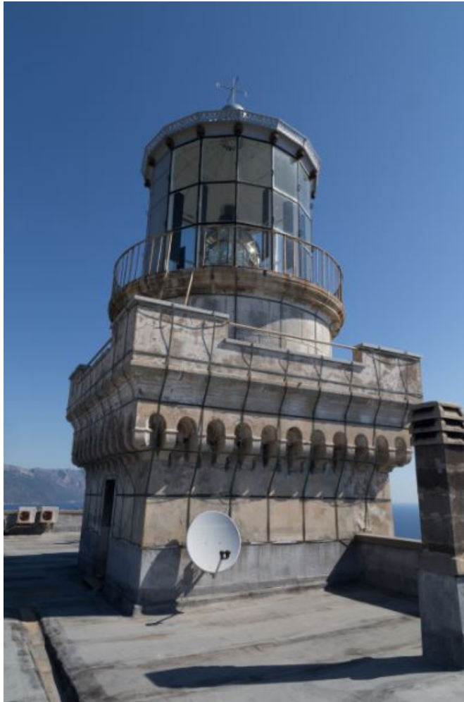
Fig. 3 - The top of the lighthouse with the Faraday cage.

The building, on two floors, has two lodgings and a room used as an office (fig. 4).