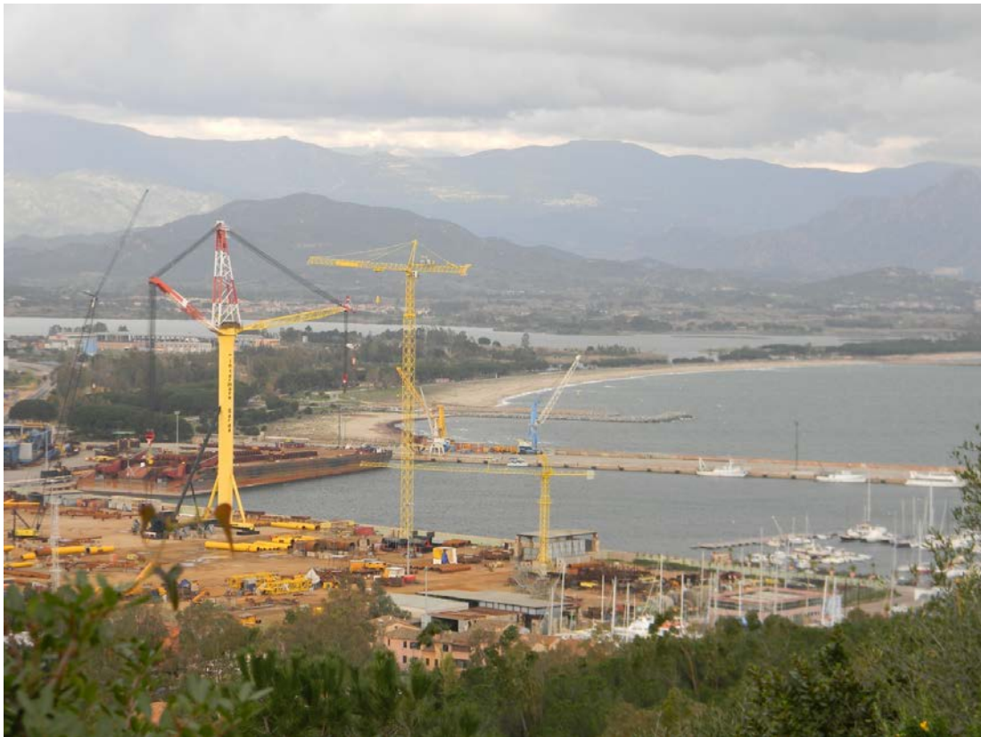
Fig. 3 - The yards of Intermare Sarda.

In the Sixties of the XX century, the port grew once more thanks to the expansion of structures linked to the sea transport of materials produced by the Arbatax paper mill, and also for the launch of the Genova-Olbia-Arbatax line and the arrival (1972) of Intermare Sarda (fig. 3) 4 .