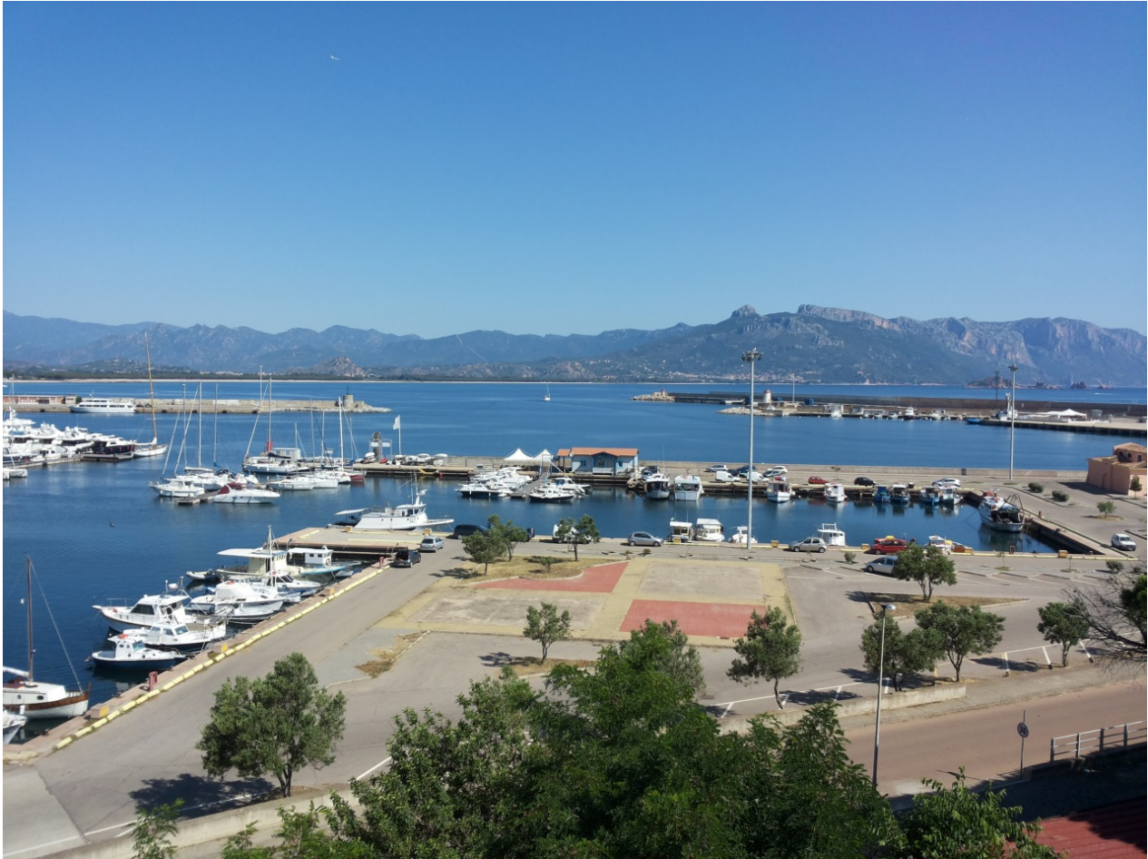
Fig. 4 - The port area.

The port now operates as a merchant stopover, well supplied with large docks and goods storage areas. It also has a dock with about 80 berths for boaters and is an attraction for tourists visiting Ogliastro (fig. 4).