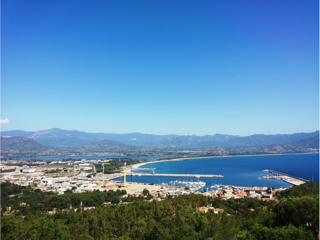
Fig. 2 - The port of Arbatax.

protests, works started again in 1882 and ended in 1893. In 1894 it was connected to the railway line to Cagliari (fig. 2).