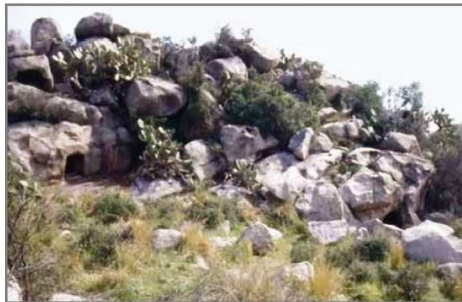
Fig. 1 - Underground necropolis of Monte Terli. The isolated boulders in which the single-cell domus de janas are dug (from Fadda 2012, p. 13, fig. 12).

The underground necropolis of Monte Terli has eight domus de janas : four dug in isolated boulders on the west side and four on a wall with no easy access (figs. 1-4).