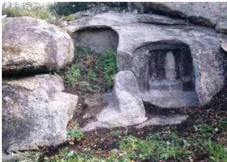
Fig. 4 - Underground necropolis of Monte Terli. Tombs 4-5 (from Fadda 2012, p. 18, fig. 17)

Menhirs are associated to the tombs. This concentration of tombs and menhirs found in the hill of S'Ortali 'e Su Monte in a specula manner, is proof of mass anthroposition of the area and the presence of neolithic settlements and farming populations. In most cases, the megaliths of Monte Terli and S'Ortali 'e Su Monte indicated burial grounds.