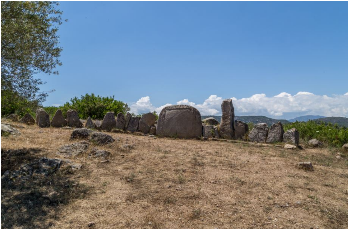
Fig. 2 - The exedra of the tomb of giants of S'Ortali 'e su Monte