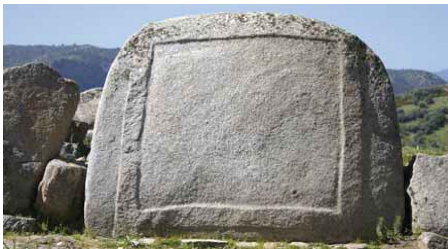
Fig. 3 - Lower part of the stalk with frame in relief (from Fadda 2012, p. 29, fig. 37).

The second burial area is at the bottom of the hill of S'Ortali 'e Su Monte . It is known as the tomb of giants of Pala Niedda and is currently inside private property. 12 metres long, it still has a row of outer wall built with granite blocks and an exedra with slighted arched