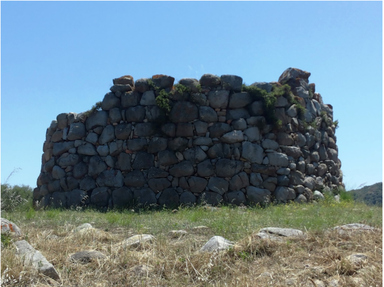
Fig. 3 - Il nuraghe di S'ortali 'e su Monteviso da nord.

The tower entrance leads to a corridor with the remains of stairs leading to the terrace still visible on the left side. From this short passage you can enter the circular chamber, originally tholos vaulted, with three large niches dug into the thick wall (fig. 4). Recent archaeological digs performed in the chamber showed that the monument was also used in subsequent late Punic and Roman periods; in the Early Middle Ages, when no longer lived in, it was used for burials 1 .