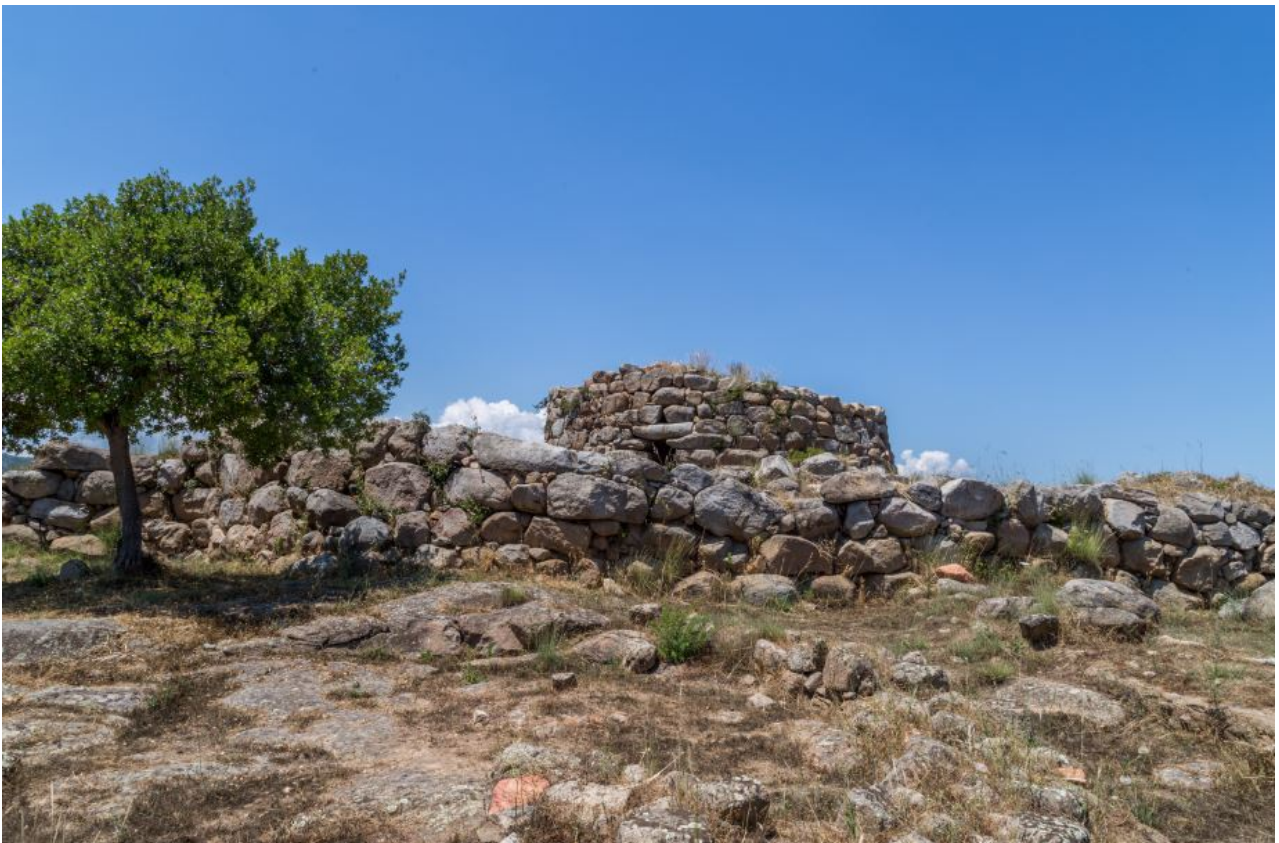
Fig. 1 - The nuraghe of S'ortali 'e su Monte

The nuraghe (fig. 1), with one tower and surrounded by an outer wall with three towers, stands 36 metres above sea level, in the higher part of the hill and is dated to the Middle Bronze Age (1500-1400 B.C.). In the outer wall, to the East, South and South-West, there were three entrances.