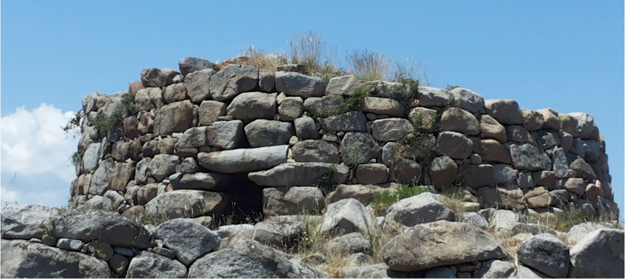
Fig. 2 - Nuraghe of S'ortali 'e su Monte : detail of the entrance with menhir used as a beam.

The central tower, only partly preserved for a height of 4.26 metres, has a South facing entrance and reuses a broken menhir belonging to the pre-nuragic period as a beam (figs. 2-3).