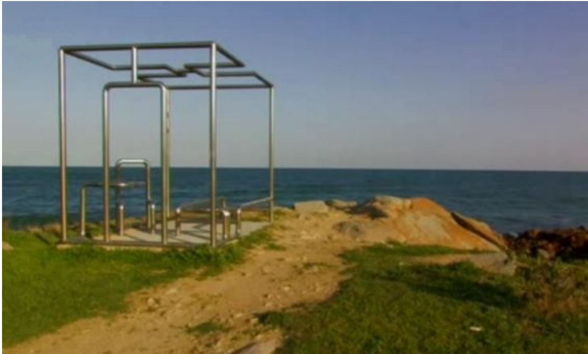
Fig. 4 - Lido of Orri: Cella Osservatorio di Stella , by Massimo Kaufmann.