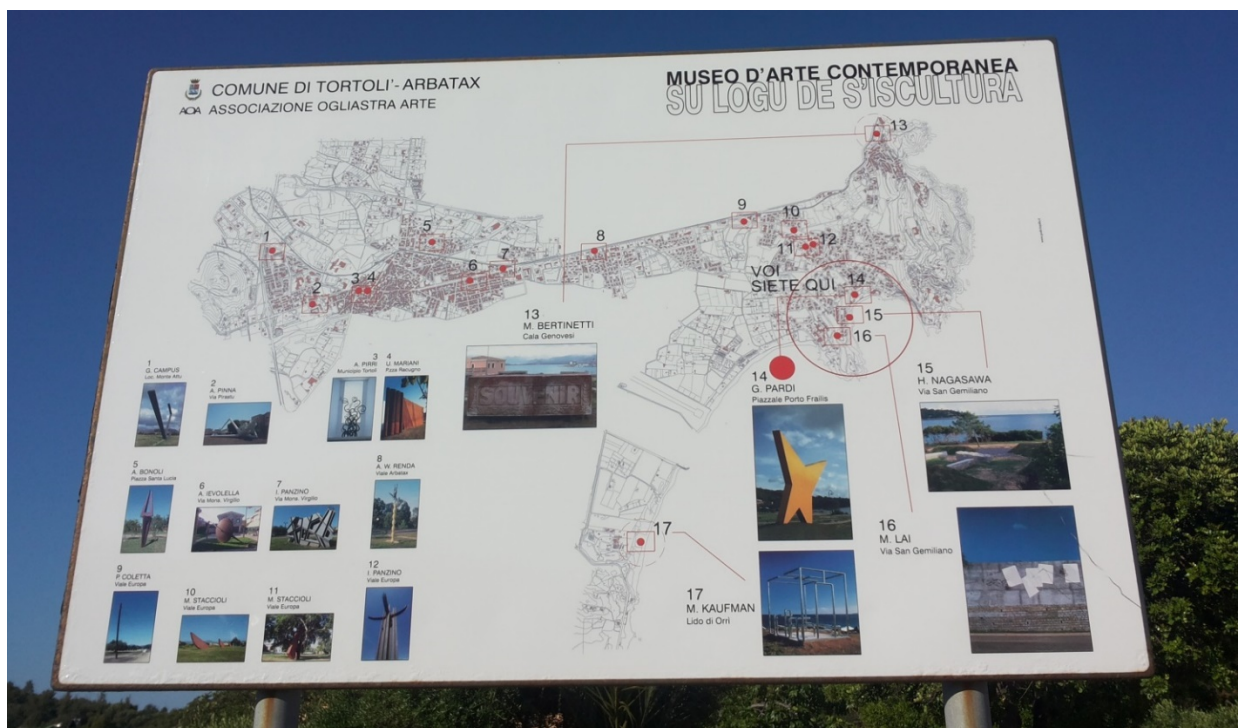
Fig. 1 - Panel illustrating the position of sculptures (photo by M.G. Arru).

Along the route you can admire the works of Maria Lai (fig. 2), Giovanni Campus (fig. 3), Massimo Kaufmann (fig. 4), Mauro Staccioli (fig. 5), Antonio Levolella, Umberto Mariani (fig. 6), Ascanio Renda, Iginio Panzino, Alex Pinna (fig. 7), Hitetoski Nagasawa, G. Pardi (fig. 8).