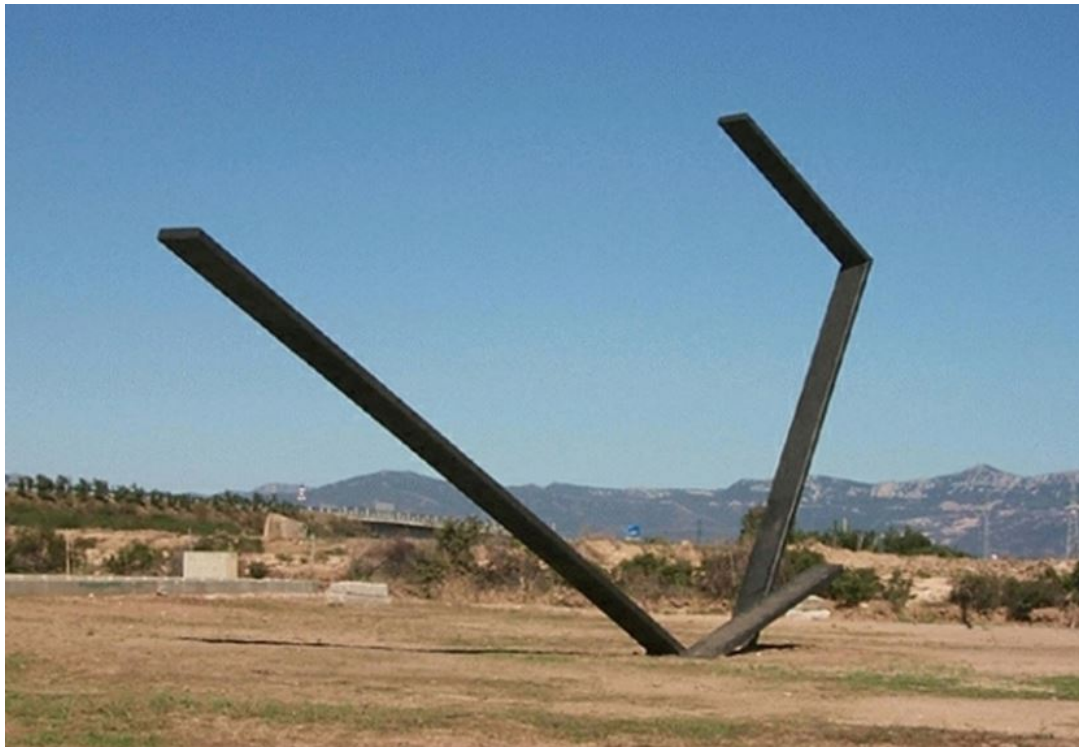
Fig. 3 - Loc. Monte Attu: Forma: rapporti e misure , by Giovanni Campus (da http://www.sardegnaigitallibrary.it/index.php?xsl=615&s=17&v=9&c=4461&id=57378 ).