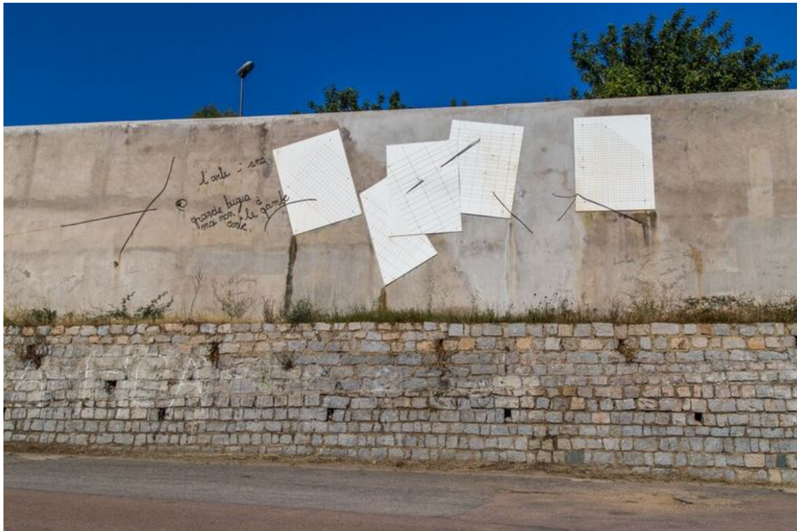
Fig. 2 - Via San Gemiliano: Tempo dell'Arte , by Maria Lai.