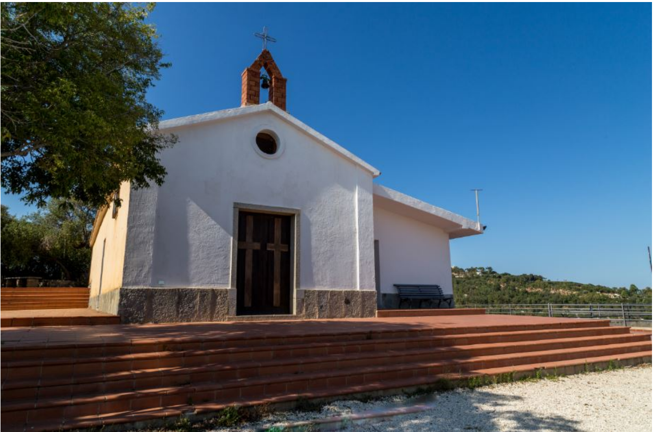
Fig. 1 - The church of San Gemiliano.

The church dedicated to San Gemiliano, in Arbatax, stands on a headland, 31 metres above sea level, close to the coastal tower of the same name, and is one of the rare country churches in Sardinia built close to the sea (fig. 1).