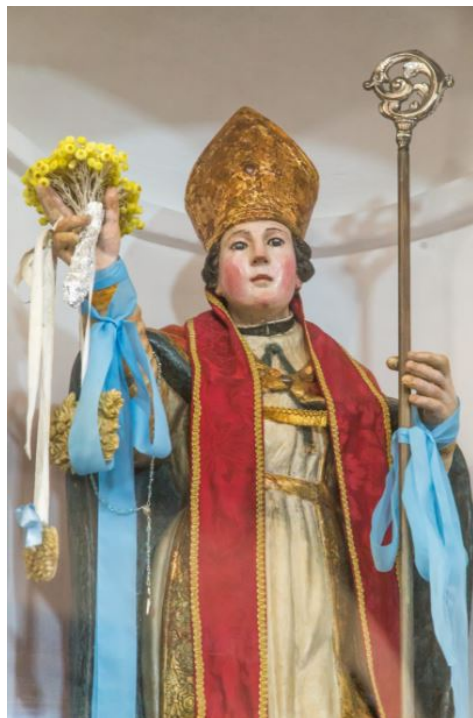
Fig. 5 - The statue of San Gemiliano kept in the church of S. Andrea in Tortolì.

The statue portraying San Gemiliano is kept in the church of Sant'Andrea in Tortolì and is carried to the country church during the religious feast dedicated to the saint (fig. 5).