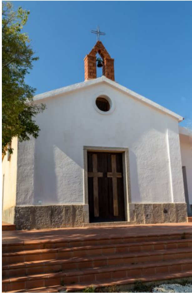
Fig. 3 - The facade of the church of San Gemiliano.

The interior, which is a single room, has seven cross walls where low arches open up. The presbytery area is slightly raised over the earthenware tiled floor. In 2009, the wall behind the altar was decorated with a pink trachyte structure holding a carved bas-relief of San Gemiliano (fig. 4).