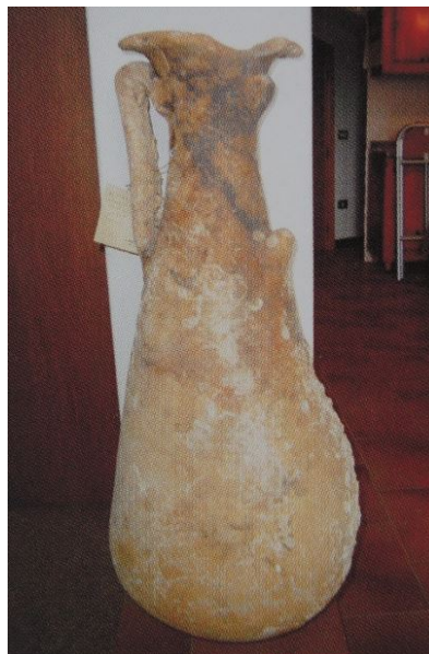
Fig. 1 – Amphora Beltrand II B recovered in the Arbatax sea (from SALVI ET ALII 2005, p. 81).

It has an elongated, pear-shaped body, considerably wider towards the base; narrow neck with no connection with the shoulder and extroflexed rim with wide mouth; belt handles; high tip (figs. 2-3). This type of container was produced in the Betica 2 . The average height in whole examples is about 100-110 cm (fig. 4). This type was produced from the start of the I century A.D. to the middle of the II and was spread throughout the Mediterranean. It was used to transport fish sauces ( muria ).