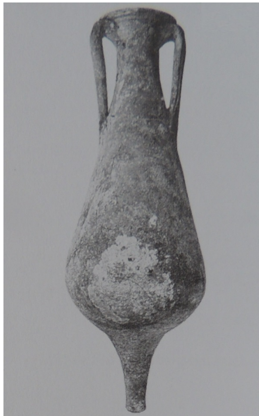
Fig. 3 - Amphora Beltrand II B (from CARVALE, TOFFOLETTI 1998, p. 128).