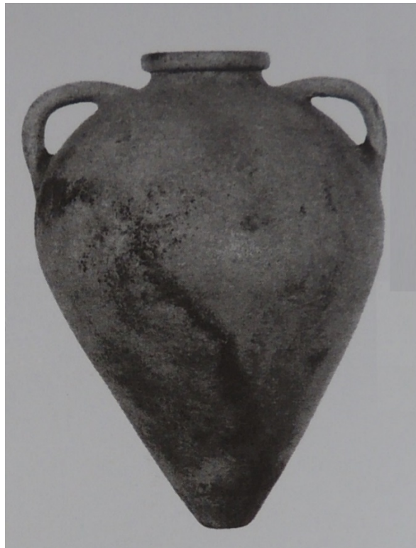
Fig. 3 - Etruscan amphora type Py 1/2, VII-VI century B.C. (from CARVALE, TOFFOLETTI 1998, p. 76).