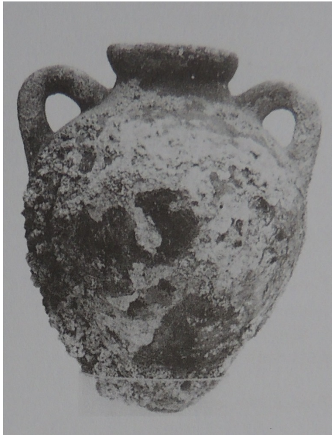
Fig. 4 - Etruscan amphora type Py 4A, V-III century B.C. (from CARVALE, TOFFOLETTI 1998, p. 79).