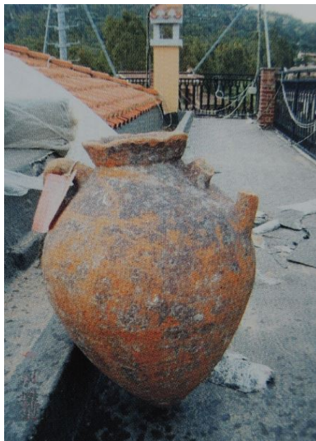
Fig. 1 - Ovoid amphora from the Arbatax sea (from Salvi et alii 2005, p. 72).

From the end of the VII century B.C., in southern Etruria they began producing amphorae to be used to export the region's wine; this lasted until the III century. These containers were found in several coastal centres of the Italian peninsular and in several wrecks along the coasts.