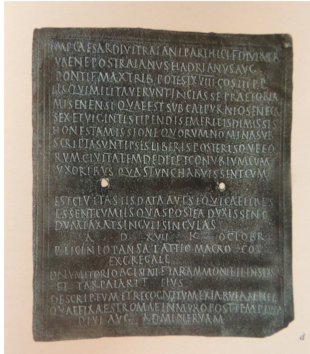
Fig. 4 - Es Outer part of table I (from Aa.Vv. 1989, p. 231, fig. 16 d).

The outer part of table I repeats the same text present on the inner part and the one engraved on the inner part of table II (fig. 4).