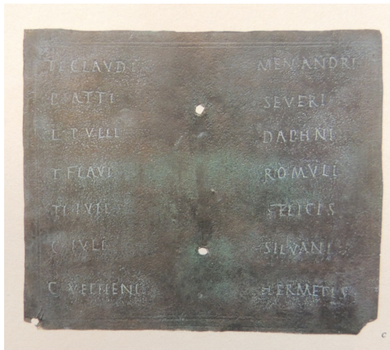
Fig. 3 - Outer side of table II with the names of witnesses (from AA.Vv. 1989, p. 231, fig. 16 c).