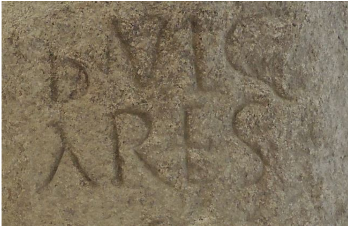
Fig. 4 - Detail of the inscription B'v'ULG/ARES.