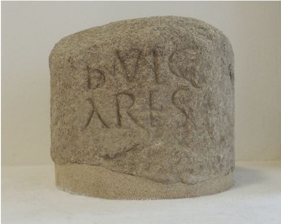
Fig. 3 - The stone of Tortoli.