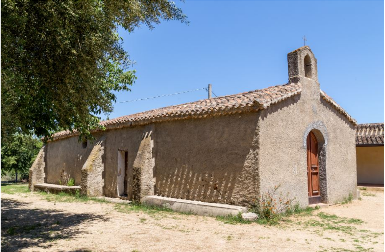
Fig. 1 - The church of San Lussorio, near where the stone was found

Numerous traces of life in Roman times have been found in the Tortolì area. In 1976, in the immediate vicinity of the country church of S. Lussorio (fig. 1), on land being ploughed, they found a grey granite, cylindrical stone, fragmented at the bottom and top (fig. 2).