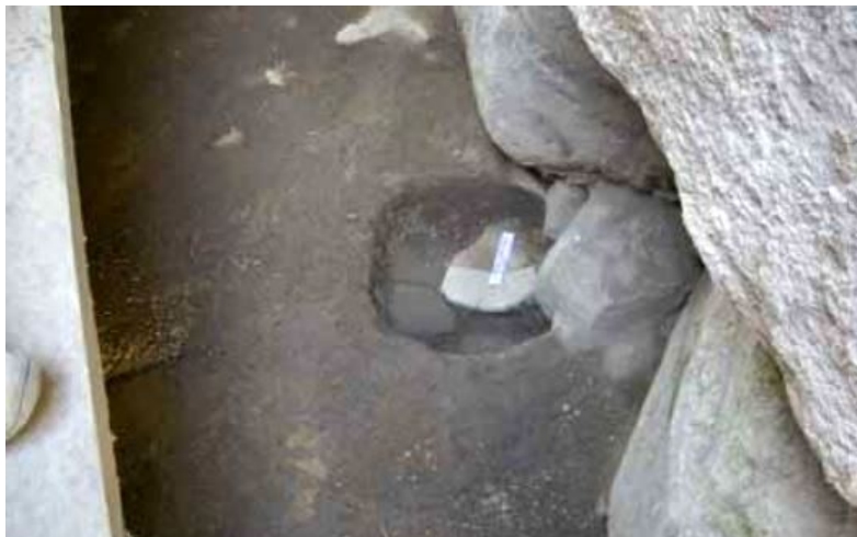
Fig. 1 - Nuraghe S'Ortali 'e su Monte. The corridor leading to the tower with the base of the nuragic vase that held the bronze axes (photo from Fadda 2012, p. 40, fig. 55).

In Tortolì, in the San Salvatore area, in the nuraghe of S'Ortali 'e su Monte, in the space between the left door jamb of the entrance to the main tower and the corridor, they found a thick vase standing on a flat stone (fig. 1). The container held a set of 19 bronze axes with raised edge and a flat heel, stacked in an alternating orderly fashion (fig. 2) that is similar in shape, weight and size to a kind widely used in Ogliastra and the rest of the island. Most of these items do not show much wear to the blades. So the fact that they were conserved carefully could be the result of a hoarding process for commercial activities linked to the considerable production of cereals in the fertile plain crossed by a river. This is proved by the presence of 12 brick silos used to hold the cereals harvested.