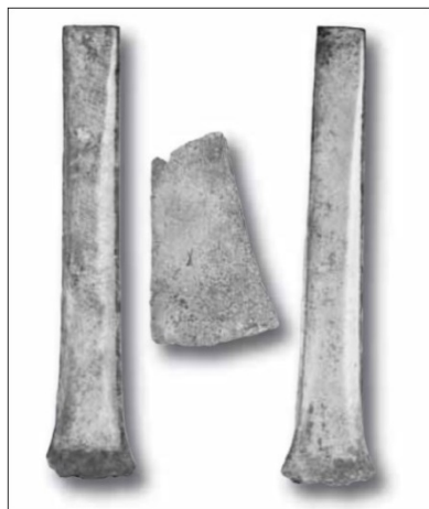
Fig. 3 - Bronze axes with raised edges and fragment of sickle from S'Arcu 'e is Forros (from Fadda 2012 b, p. 19, fig. 24).

Moreover, we can hypothesise the existence of close relations and trade between the mountain populations of the inland areas and the communities living on the coast, as is proven by the presence of similar axes in the metalworking centre of S'Arcu 'e is Forros of Villagrande Strisaili (fig. 3) and further north, in the Sisine di Nule nuraghe (fig. 4).