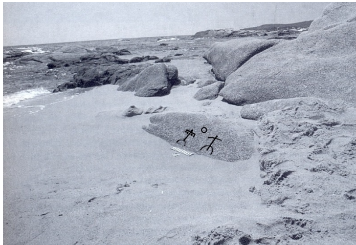
Figs. 2, 3 - The rock on the Orrì beach with the petroglyph (from Archeo System 1990 a , p. 69).