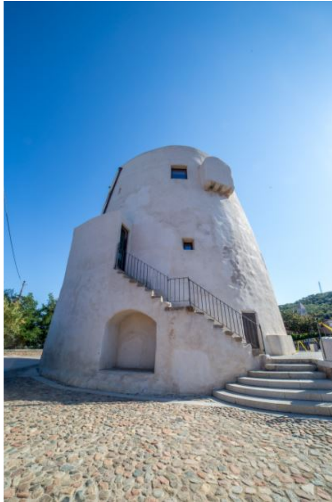
Fig. 8 - The tower of S. Miguel.

The tower of San Gemiliano, built in 1587, was originally called “Taratasciar” in Arabic, the “thirteenth tower”. In the XVII century, it was named the tower of Zacurru and only acquired its current name in 1767. It stands 43 metres above sea level, on a small headland guarding the bay of Porto Frailis, at about 4 Km from Tortolì. You have a view of over 25 km from the building.