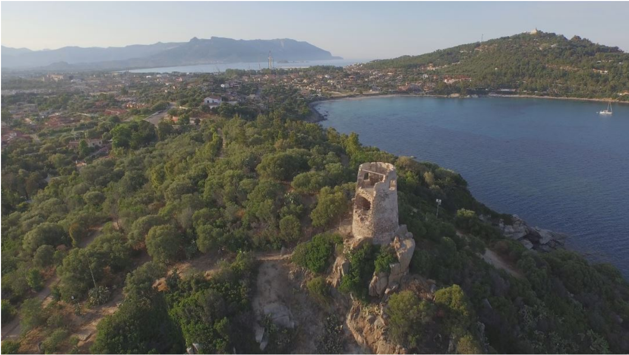
Fig. 9 - The tower of S. Gemiliano (photo Unicity S.p.A.).

Built with local granite blocks, cone-shaped and slender in structure giving it a diameter of 7 m and a remaining height of 12 m. The raised entrance, at about 4 metres up to guarantee the building better defence, could be reached by a rope or wooden ladder. The space the guards lived in was a small room covered by a dome measuring about 13 m 2 , with two gun slits. Going up wooden stairs, through a trap door, you reached the terrace holding canons and where soldiers were protected behind a wall (that is a brick parapet present only on one side of the tower towards land). The tower was assigned an alcaide , that is a captain, two soldiers and an arsenal with six rifles, a cannon and two mortars. It was abandoned a few later after the Royal Administration of Towers was suppressed in 1842.