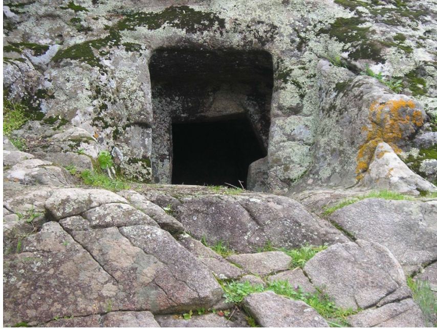
Fig. 2 - The domus de janas dug under the hill of S'Ortali 'e su Monte.