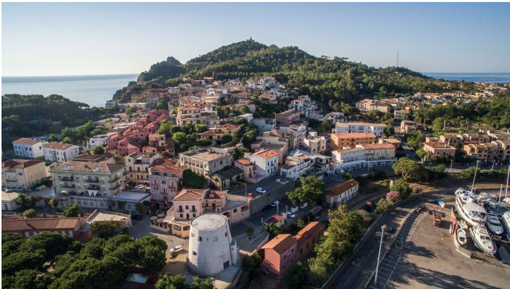
Fig. 7 - The tower of S. Miguel and, in the background, the Bellavista lighthouse.

The tower guarding the harbour had canons and mortars. It was subjected to several attacks and attempts to land over the centuries. In 1846, they stopped using the building for lookout and defence purposes and it became a Tax Police barracks.