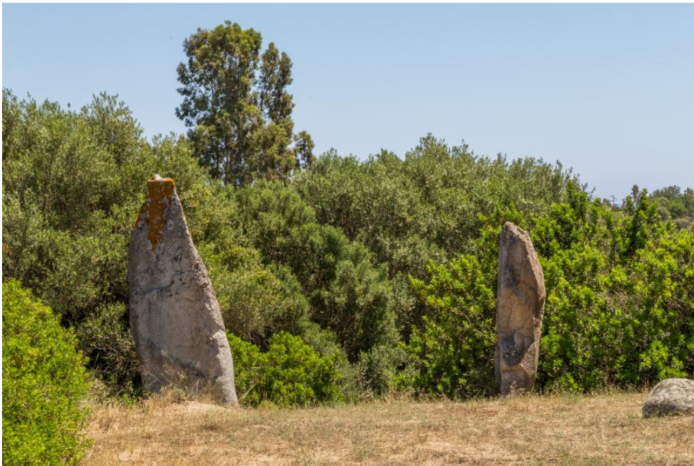
Fig. 3 - The menhirs in front of the tomb of giants of S'Ortale 'e su Monte.

The Nuragic Age was full of nuraghi, both simple and polylobate and some burial sites, like those of S'Ortali 'e su Monte (figs. 4-5).