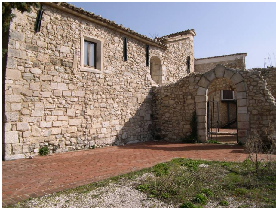
Fig. 1 - The entrance door to the Monastery of San Giorgio a Roccamorice, Pescara.

The digs at the Trullas site over the years, in 2002, 2005 and 2006, have allowed identification and definition of the spaces of the monastery next to the church of San Nicola. However, no data has emerged from the studies and remains found that lead us to think of the presence of a direct entrance to the monastery. It also seems unlikely that the entrance to the convent was only through the church, as the transportation of food and other daily necessities for the monks would have created considerable problems. In fact, storerooms for food were necessary in Benedictine convents, where the monks lived a life of prayer and work, often agricultural. In light of these considerations, it may be right to hypothesise that there was a secondary entrance with direct access to the monastery storerooms, without having to pass sacks and other bulky goods inside the church, not just small, but also fully decorated with frescoes.