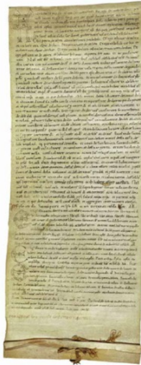
Fig. 1 - Donation document of the church of San Nicola di Trullas, 1113 (State Archive, Florence).