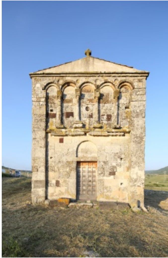
Fig. 3 - Church of San Nicola di Trullas.