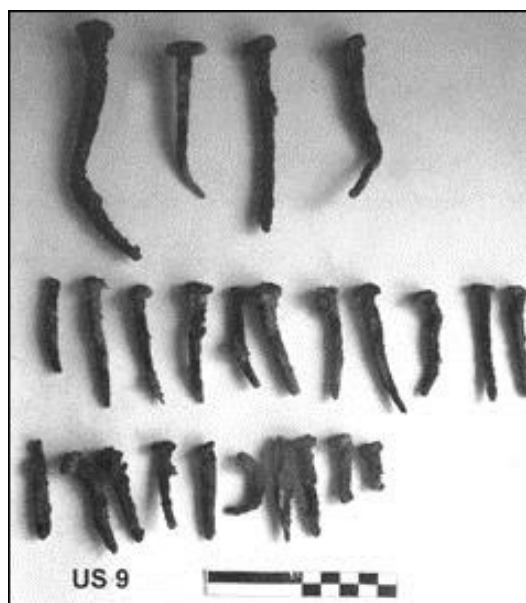
Fig. 1 - Type of nails found in the digs (photo from the Municipality of Semestene).

In addition to iron objects, bronze items have also been found mostly for locking drawers and trunks (fig. 3). Other bronze items have been found ( oil lamps figs 4-5) as well as iron items (nails and also a knife blade) datable to the 14th century. Similar items were also found in similar contexts such as the castle of Monreale, Sardara (CA), but most were new ones.