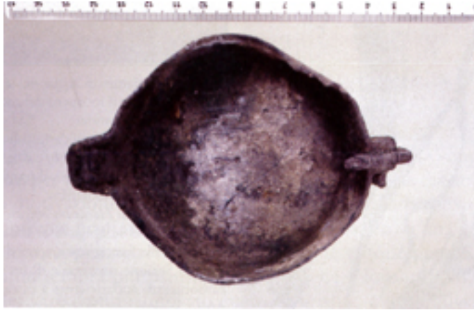
Fig. 5 - Oil lamp (photo from the Municipality of Semestene).