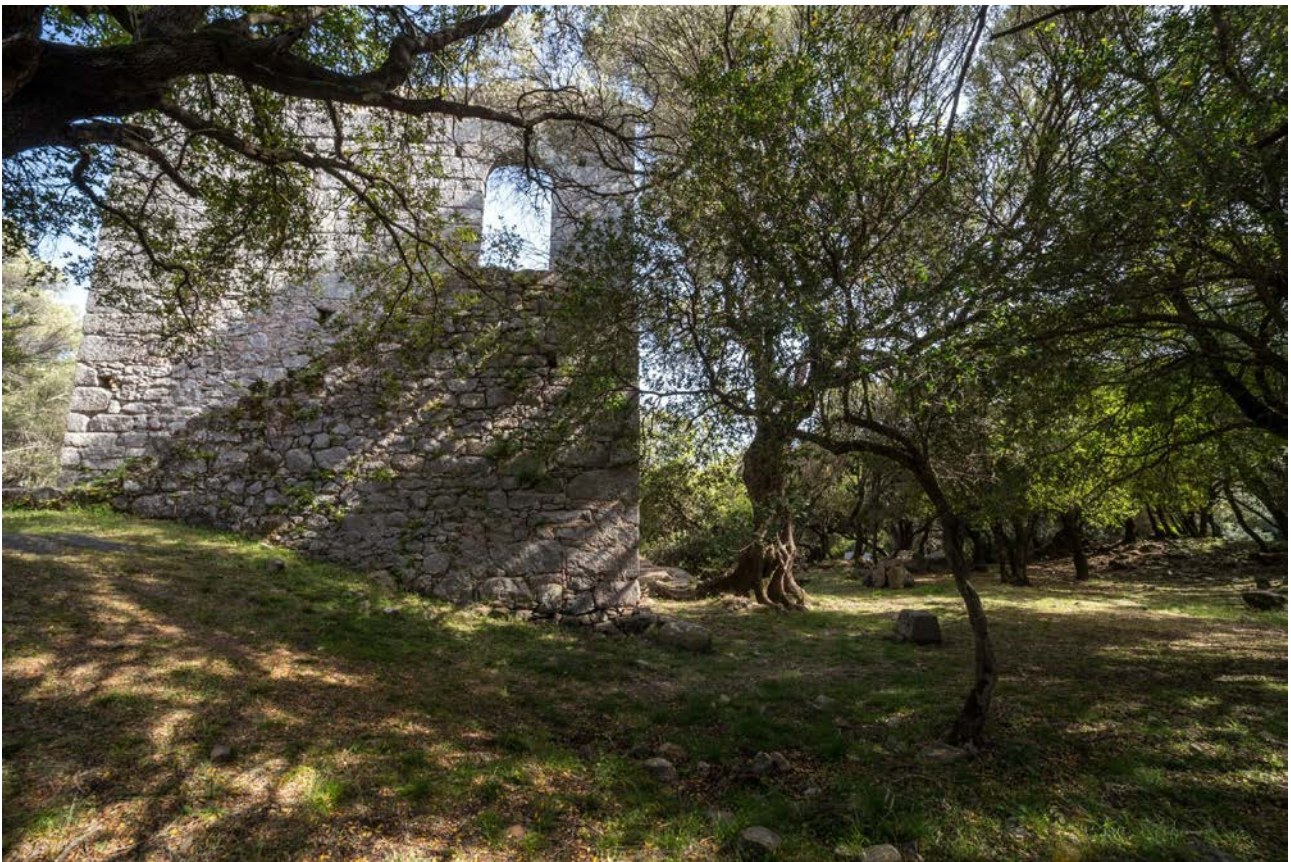
Fig. 1 - Luogosanto, the Palace of Baldu (photo by Unicity S.p.A.).

Ubaldo II Visconti is the historical figure which tradition mainly connects with the Palace of Baldu and from which it takes its name: he had his official residence in the Giudicato palace of Civita (the current Olbia), while the castles of Baldu (fig. 1), Balaiana and Monteacuto, were his summer residences.