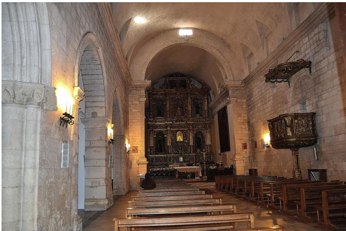
Fig. 4 - Sassari, the church of San Pietro di Silki: interior.

On 27th January 1238 in the monastery of San Pietro i Silki (fig. 4), Ubaldo Visconti wrote his testament in which he expressed his will to leave his domain of Gallura and the rights over the Giudicato di Arborea to his cousin Giovanni Visconti. He died the same year and, according to tradition, he was buried in the crypt of the Basilica of Our Lady of Luogosanto, where his mother had already been laid to rest.