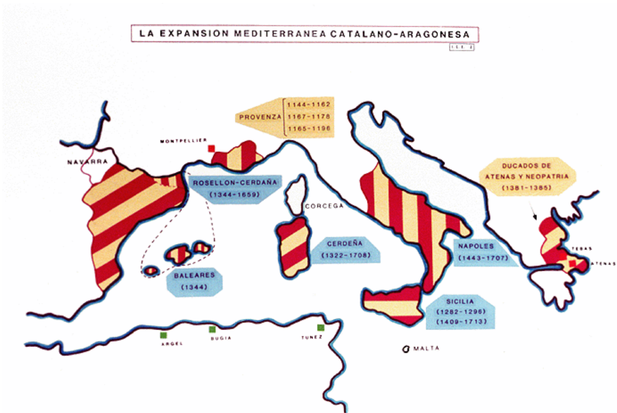
Fig. 1 - The expansion of the Crown of Aragon (from http://ifc.dpz.es/webs/ubiето/fichas-ubiето/58.html ).

The village of Sent Steva, connected with the Palace of Balbo, according to hypotheses was certainly active when Sardinia was already under the rule of Catalonia and Aragon: the centre is mentioned in a survey of rents paid by all the villages owned by the Crown of Aragon in the Island (fig. 1) on the date of being filled out, so that the taxation capacity of all the possessions could be understood.