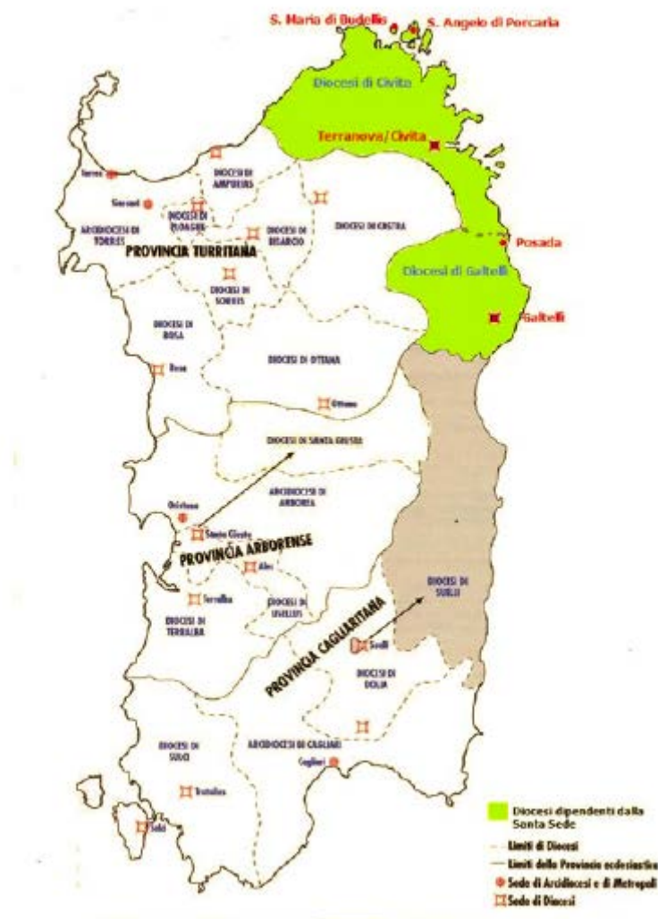
Fig. 1 - Subdivision of the dioceses in Sardinia during the Middle Ages (from Turtas 1999, p. 968).

From the twelfth to the sixteenth century, the territory of the diocese of Civita spread across the northern part of the Giudicato of Gallura, which included within its southern border Fundi de Monte as the last curatoria, leaving Posada to the diocese of Galtelli (fig. 1) The name of the diocese corresponds to the curatoria of Gallura and to the village of Civita.