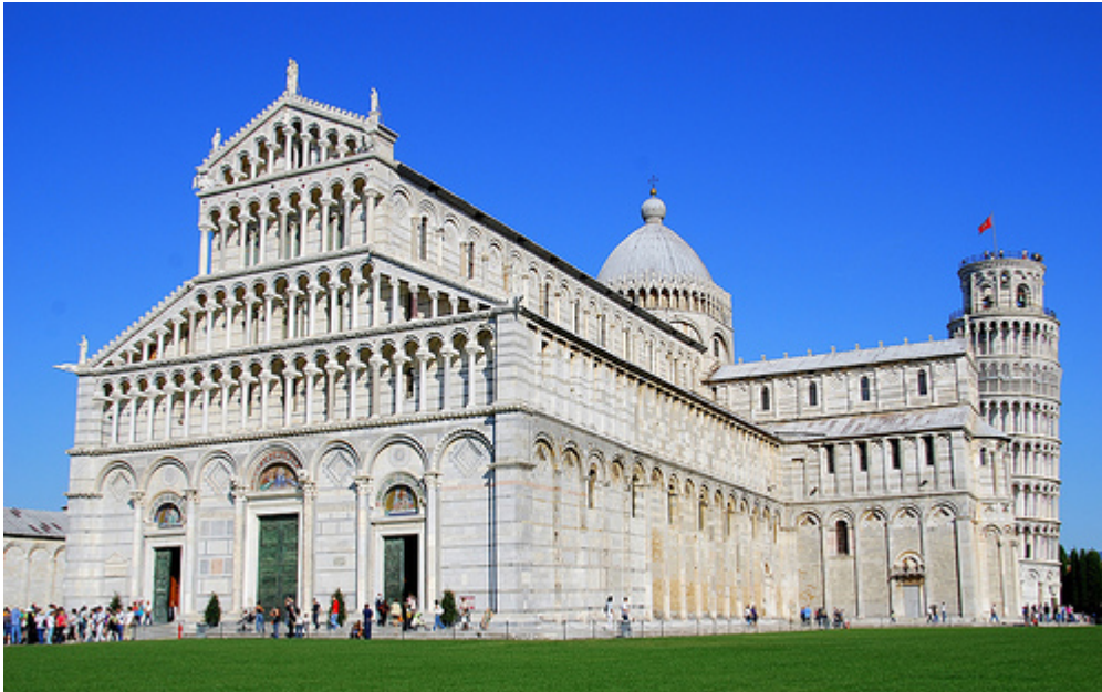
Fig. 3 - Pisa: Cathedral of Santa Maria Assunta.

two dioceses did not justify elevation to the rank of metropolis for one of them, that would have extended its jurisdiction to the other one. To stop interference in this circumstance by the three largest giudicati, it was decided to assign the two dioceses to direct Papal direction, that lasted until 1138, when Innocenzo III established their annexing to the city of Pisa (fig. 3).