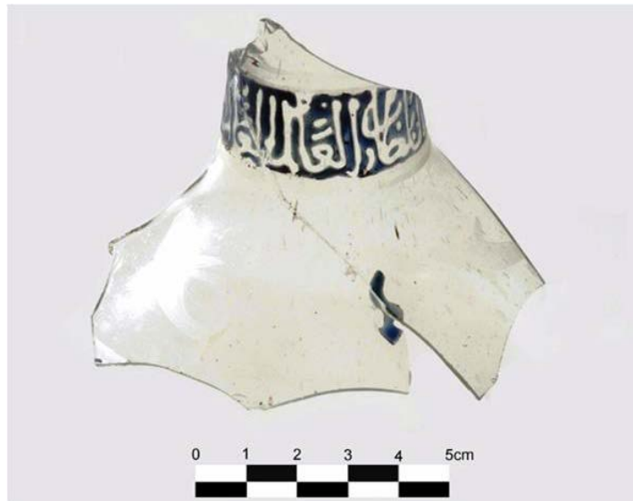
Fig. 1 - Vitreous fragment with enamelled Arabic inscription found in the palace of Baldu.

The presence of Arab goods in the complex of the Palace of Baldu raises questions concerning the socio-economic relations between the Islamic world and Sardinia, at a time when the Mediterranean basin was a place of intense exchanges between western and eastern states.