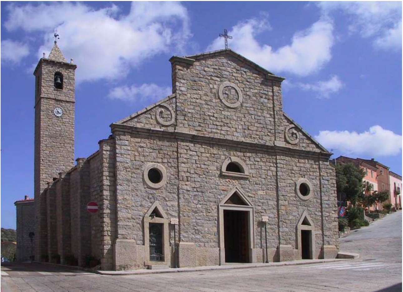
Fig. 1 - Basilica of Our Lady of Luogosanto.

In the centre of the town is the Basilica di Nostra Signora di Luogosanto (fig. 1), dedicated to Mary the child.