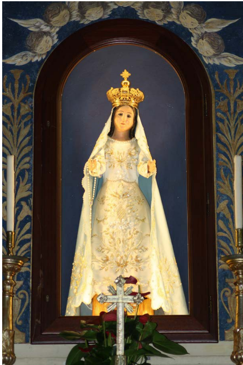
Fig. 2 - Basilica of Our Lady of Luogosanto: statue of the Virgin Mary.

housed under the large altar. The latter was elevated to the dignity of Basilica by Pope Honorius III, who equipped it with the Holy Door which is opened on September 8 (the Nativity of Mary) for a whole year every seven years. A wooden statue of the Virgin was also found on the beach of Cannigione in Arzachena and taken to the church dedicated to her (fig. 2).