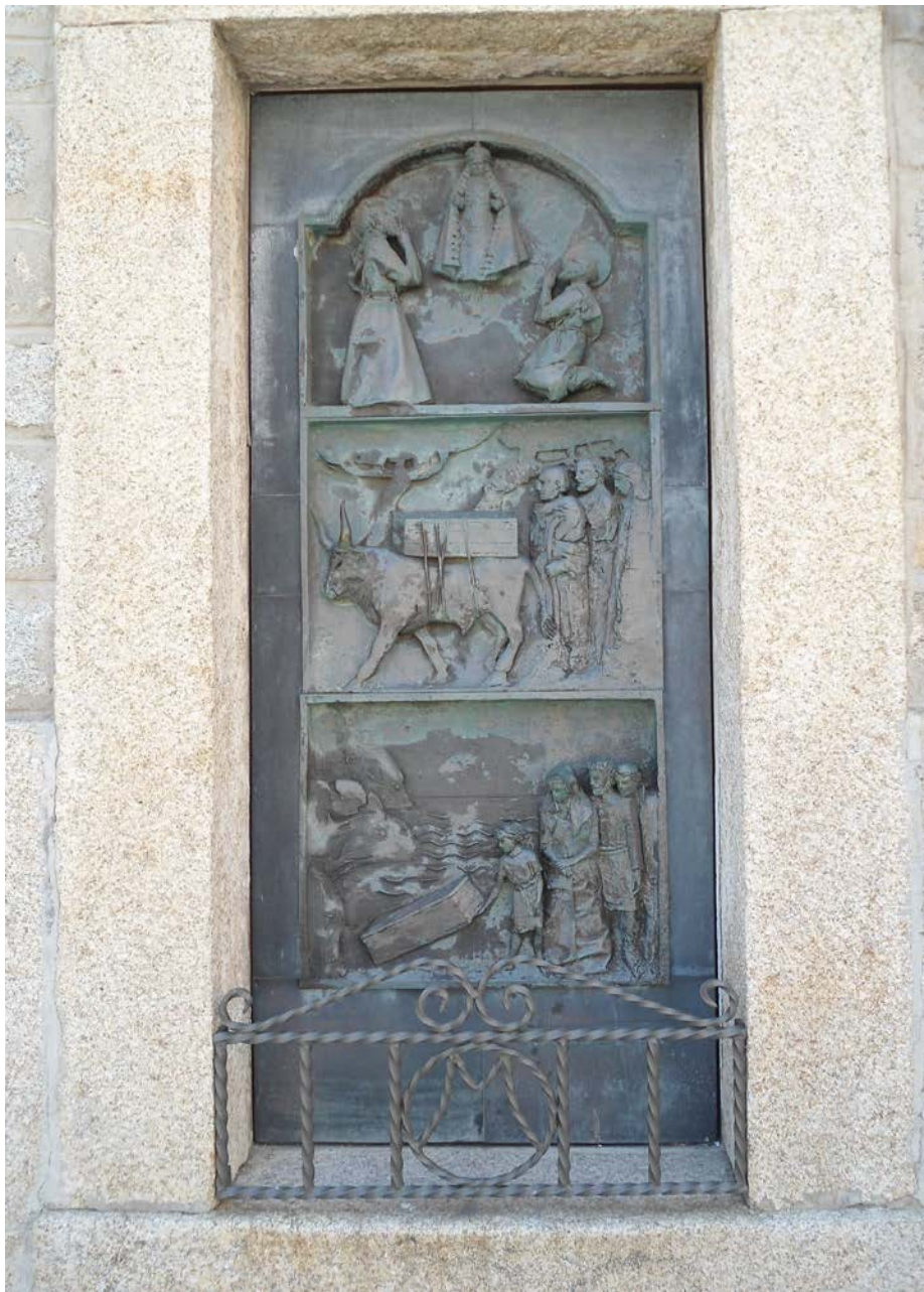
Fig. 3 - The holy door sculpted by L. Luchetti during the seventies (Photo by C. Cocco).

protected the statue in its trip across the seas; in the central one the transportation to the building of worship and in the upper part, the Virgin Mary venerated by the saints Trano and Nicola (fig. 3).