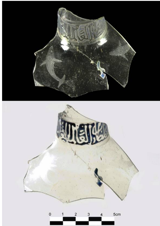
Fig. 3 - Fragment of an Islamic oil lamp with glazed inscription and incised decorations.

The presence of rare and sought after goods in the Palace of Baldu has led to the hypothesis that the buyers belonged to an upper class or that there were exchanges of gifts between political figures who visited the complex.