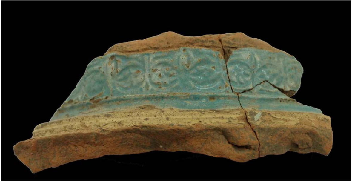
Fig. 2 - Fragment of jar with impressed band and turquoise enamel decoration.

lands where they traded their goods for local produce; these goods could also be spread through the Spanish and African coasts. These jars with engraved band decorations were probably produced in the thirteenth century in Morocco and southern Spain (fig. 2)