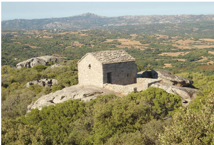
Fig. 2 - The church of San Leonardo of Balaiana.

The devotional space, also known as Santu Ninaldu , stands atop a granite outcrop which dominates much of the territory of Luogosanto (fig. 2); it is in the Balaiana region, that can be reached on foot by going up a steep path. The architecture has undergone some restoration work; it was officiated until the last century.