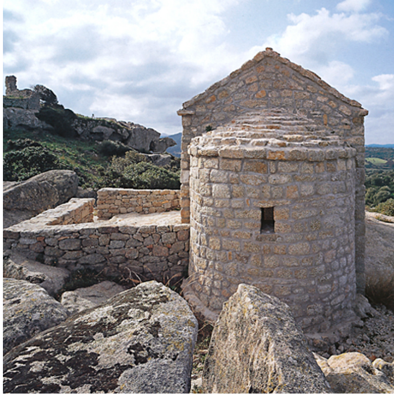
Fig. 4 - Church of Leonardo, apse: view from the East.

Its small size suggests that it was used by the castle's garrison and its shape leads to the possibility of dating it back to the second half of the twelfth century AD. Similar structures were found in nearby Corsica, leading to assume the presence of craftsmen skilled in the use of granite who operated during the Romanesque period.