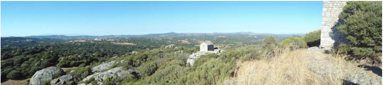
Fig. 1 - Overview of the Balaiana area: on the right the castle, at the centre the church of San Leonardo.

Three kilometres as the crow flies from the palace of Baldu there is the castle of Balaiana, still linked by a footpath to the church of San Leonardo, located a few dozen metres to the north (fig. 1).