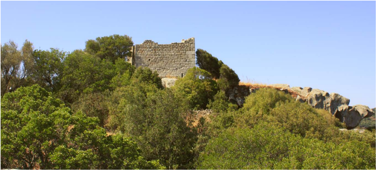
Fig. 4 - Luogosanto, Castle of Balaiana: view from the North (photo by F. Collu).