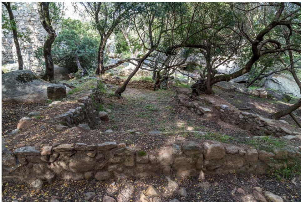
Fig. 4 - The Palace of Baldu, room \kappa , seen from the West.

The seventeen rooms appear to have had different uses: kappa was hypothesised as a home.