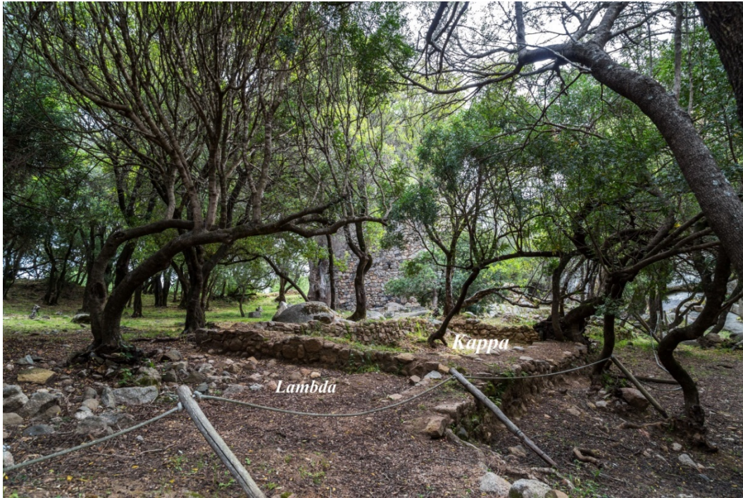
Fig. 3 - The Palace of Baldu, rooms \lambda and \kappa , view from the south-west.

At the end of the excavation, the last activity carried out was that of restoring the walls, which were collapsing because of the cork oak roots which surround the complex.